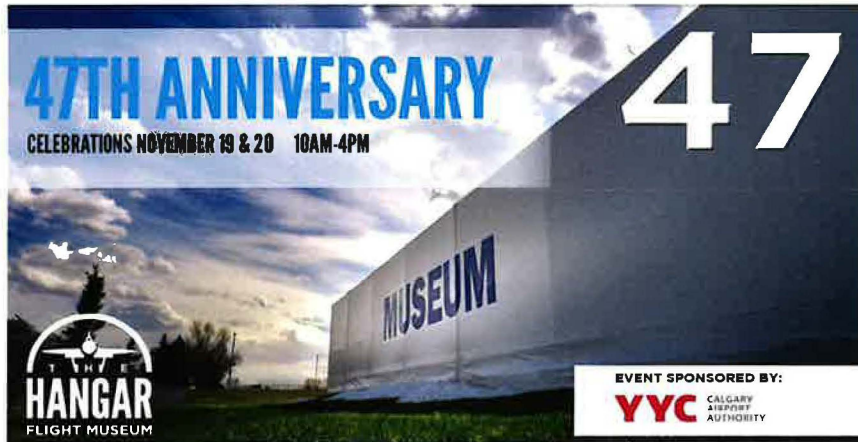
Grow Tourism, Events, Education Programming