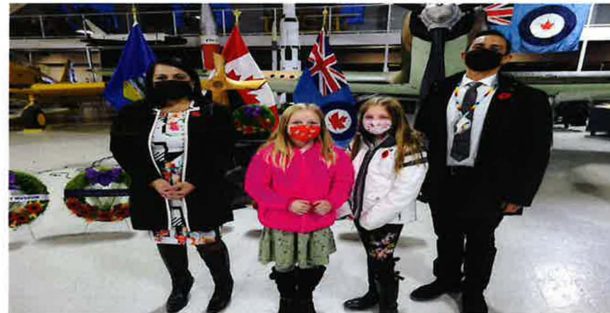
Foster Diversity, Equity and Inclusion