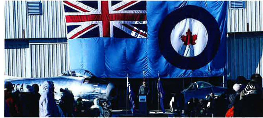
Building a More Resilient Organization