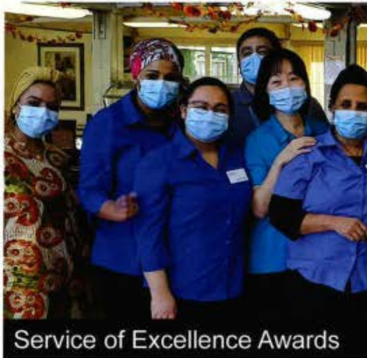
Service of Excellence Awards

Support job/careers with noble work and as part of our high performance team