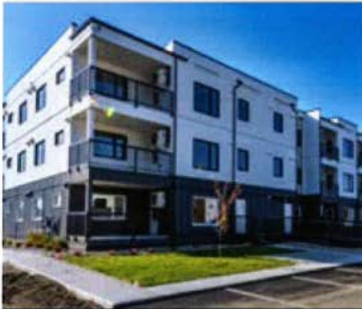
Artist's rendering of Livingston

Grow and Maintain Affordable Housing Options