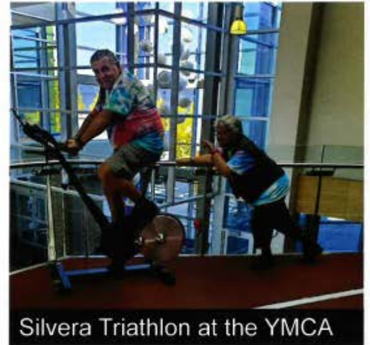
Silvera Triathlon at the YMCA

Strengthen service with collaborative partnerships