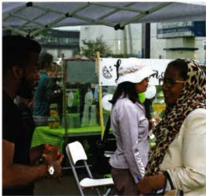
Federation launch of ActivateYYC to get Calgarians walk, playing and being neighbourly.