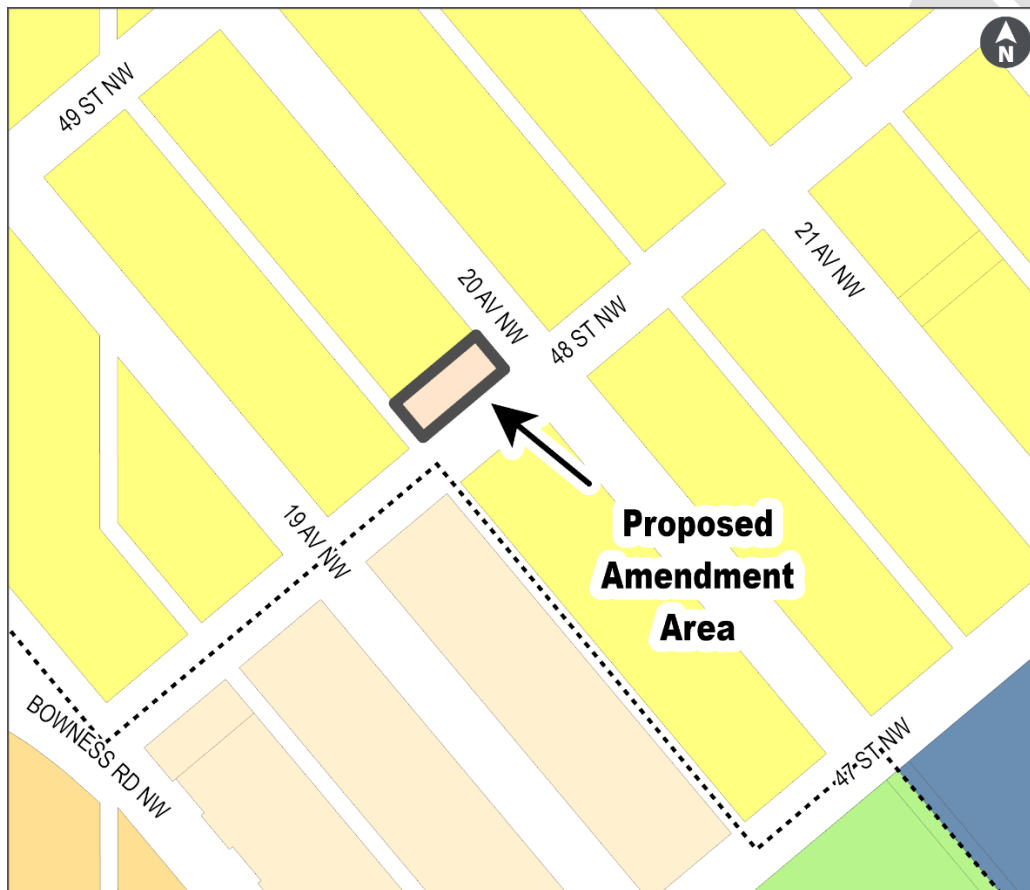
Figure 1.3 Future Land Use Plan