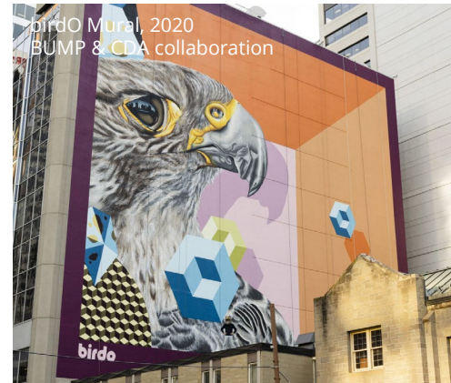
birdo Mural, 2020 BUMP & CDA collaboration