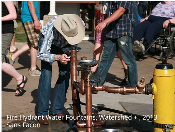
Fire Hydrant Water Fountains, Watershed + , 2013 Sans Facon