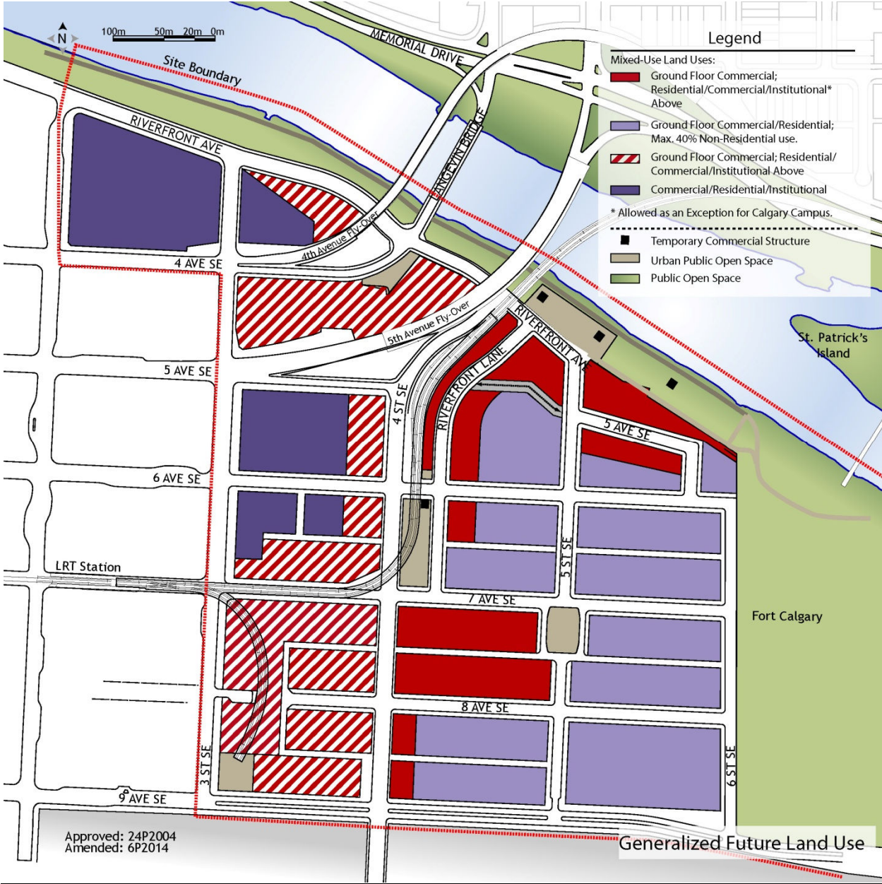
Fig. 4.01 Generalized Future Land Use