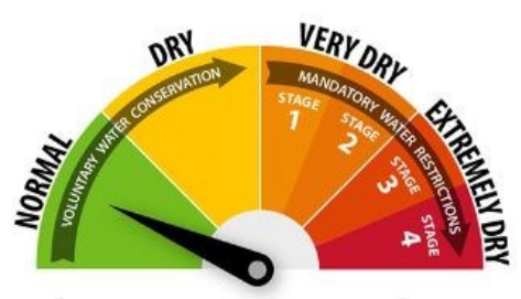
Calgary Drought Conditions

Recommended City Action: Continue education about native plants and pollinators and provide avenues for people to contribute meaningfully.