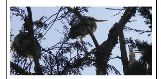
Protection of Great Blue Herons: A discussion of conservation tools in the planning process