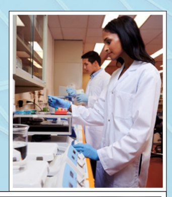
51% talent agree that Calgary has a diverse economy