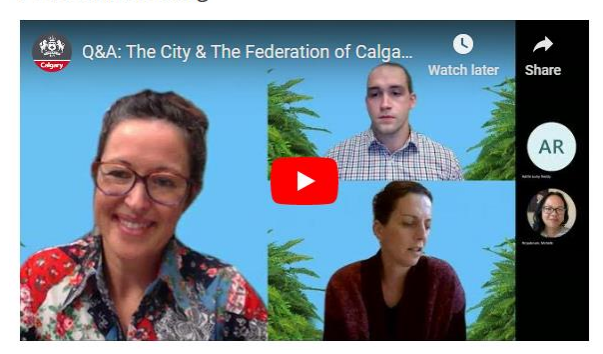
Q&A Part 2. The City & The Federation of Calgary Community answer more questions on the proposed changes to residential zoning

Q&A: The City & The Federation of Calgary Communities discuss proposed changes to residential zoning