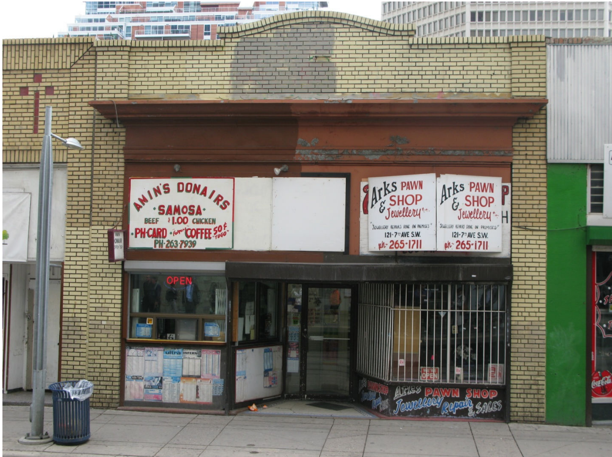
North façade of the westerly portion of 121 7 Av. SW