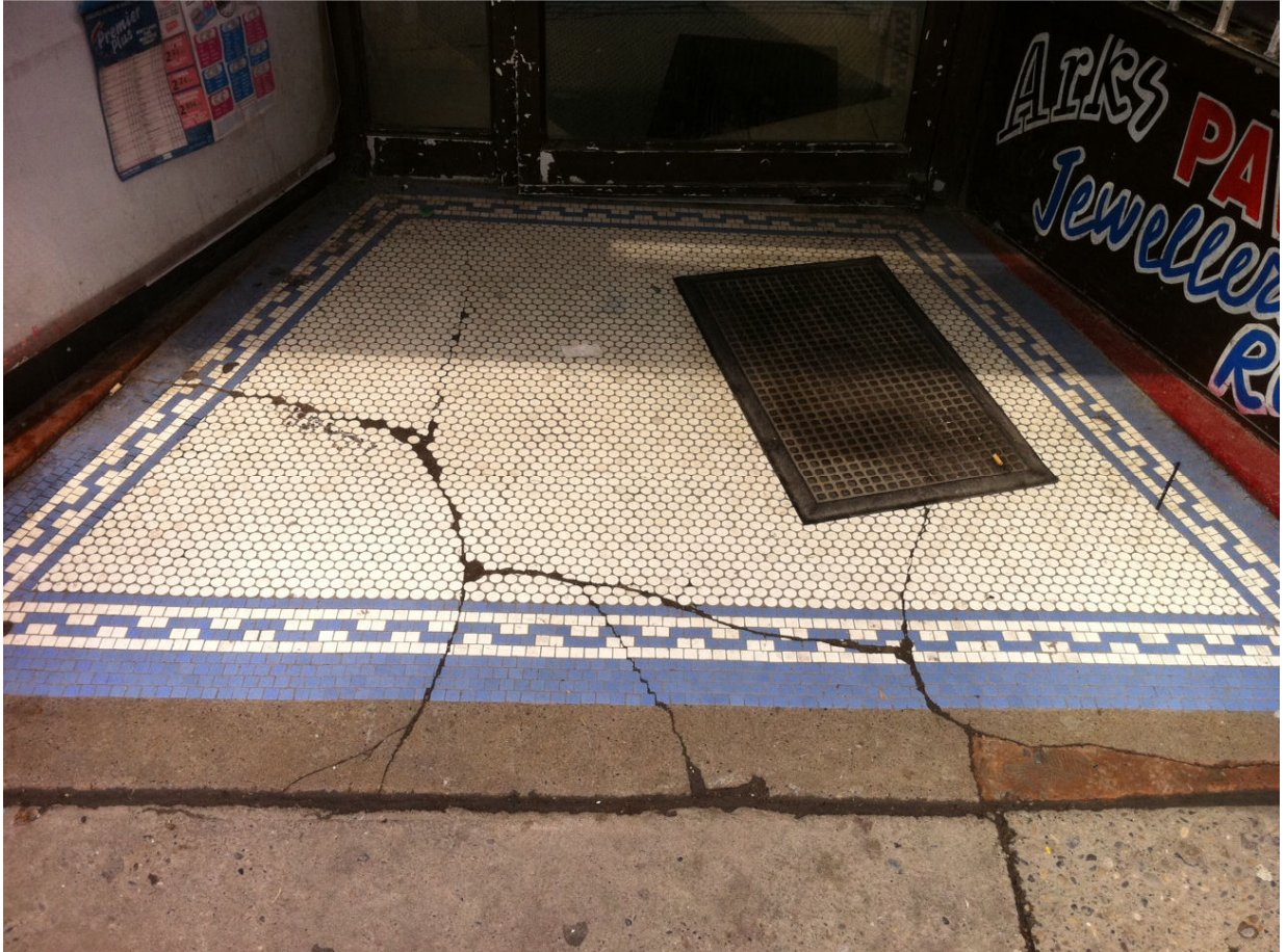
Recessed entry flooring of the westerly portion of 121 7 Av SW