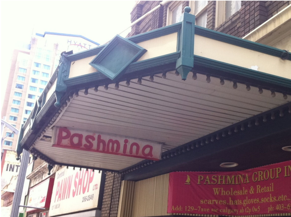
Suspended canopy of 129 7 Av. SW