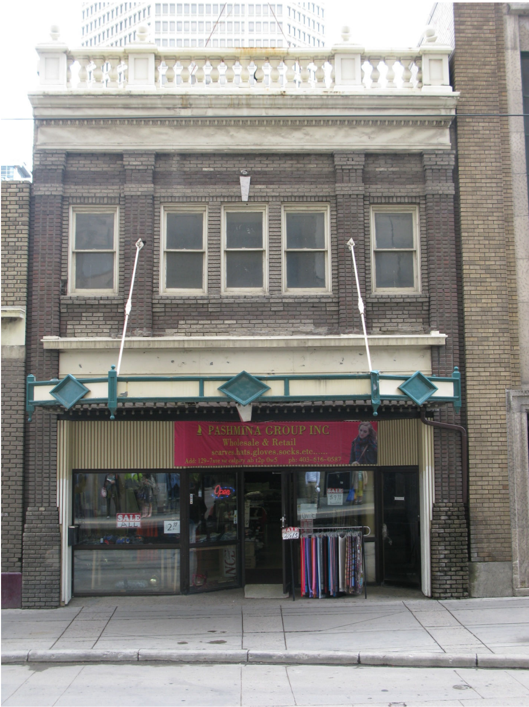
North façade of 129 7 Av. SW