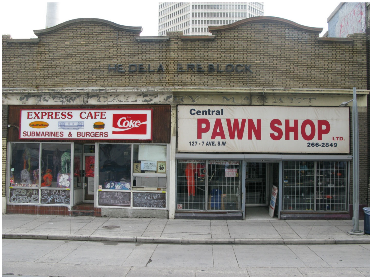
North façade of (left) 125 & (right) 127 7 Av. SW