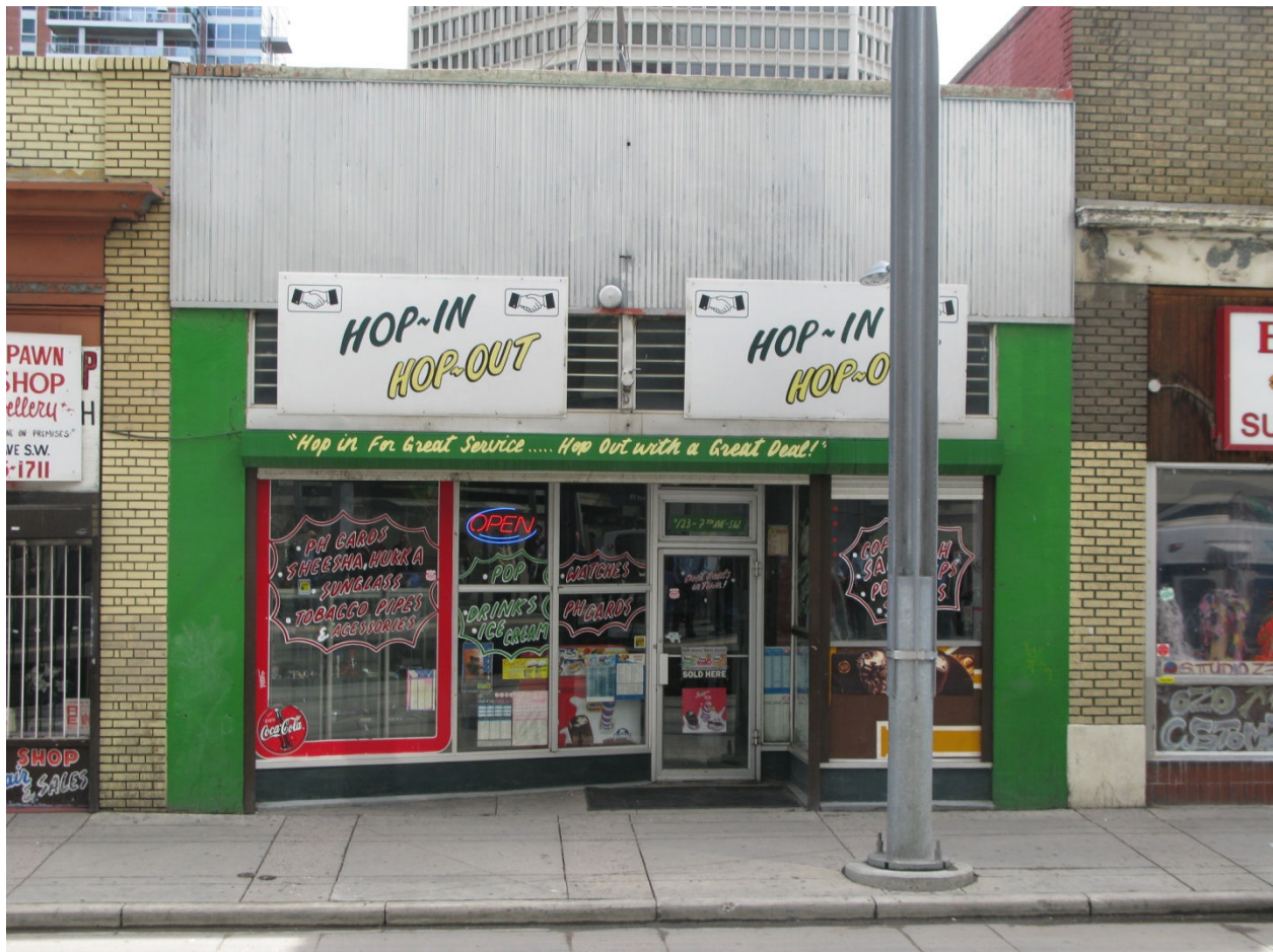
North façade of 123 7 Av. SW