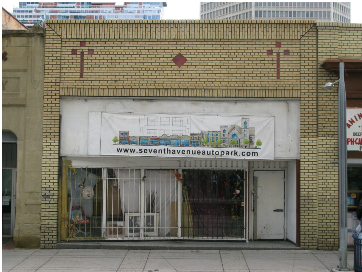
North façade of the easterly portion of 121 7 Av. SW