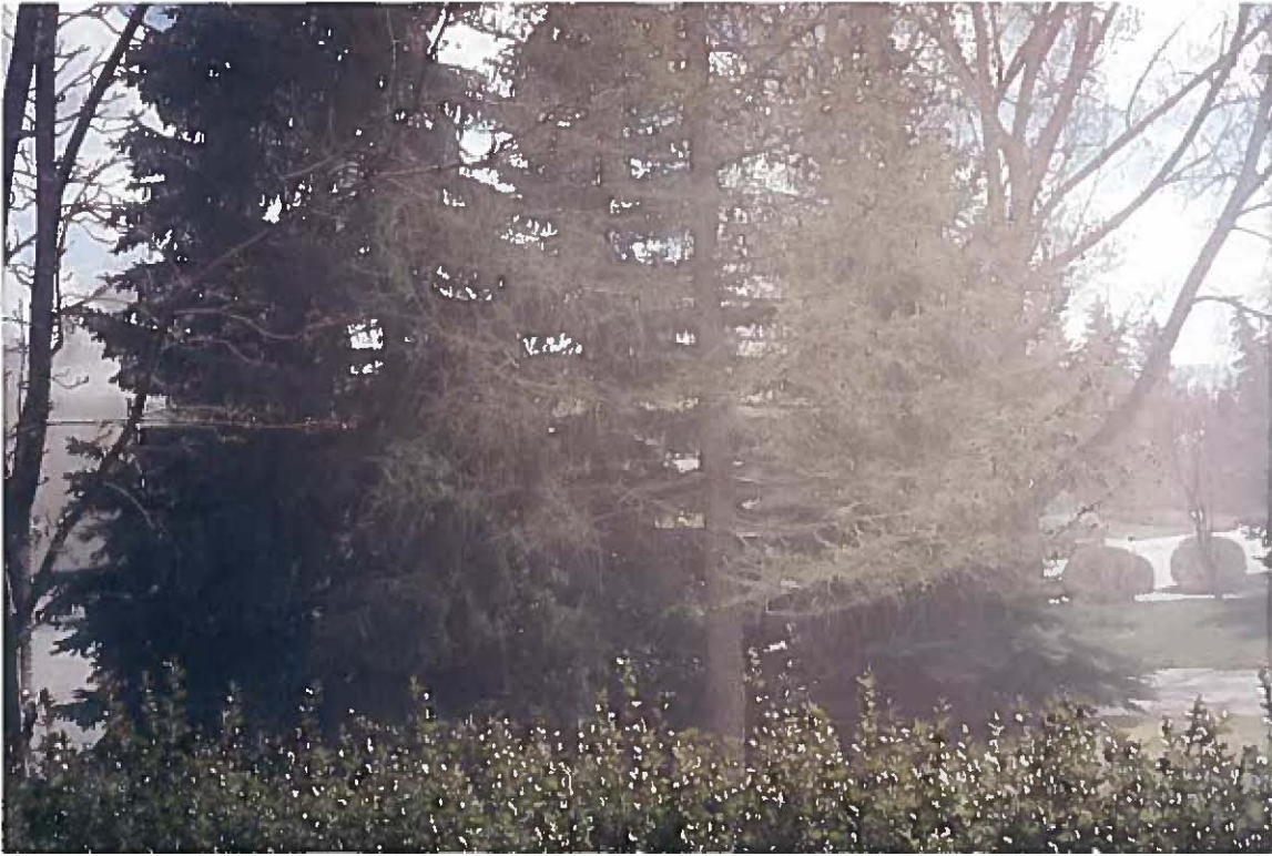
FRONT VIEW DURING DUST STORM