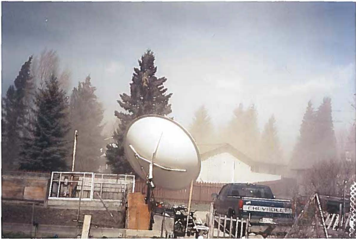
BOTH ARE BACK YARD VIEWS OF DUST STORM DURING CONSTRUCTION OF CHILDREN'S HOSPITAL.