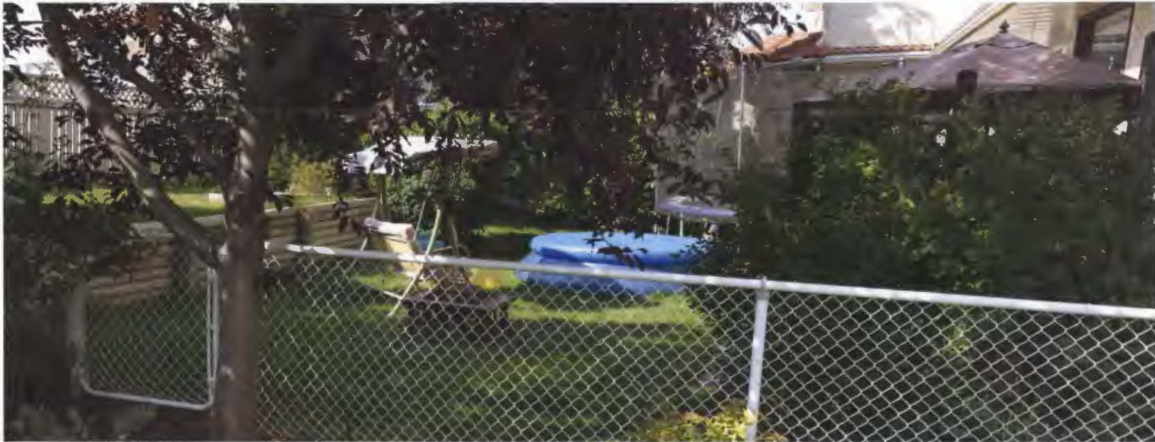
Back yard at #9 Signature Close SW – Very small and terraced with a retaining wall. Just a narrow strip of land between house/deck area and retaining wall