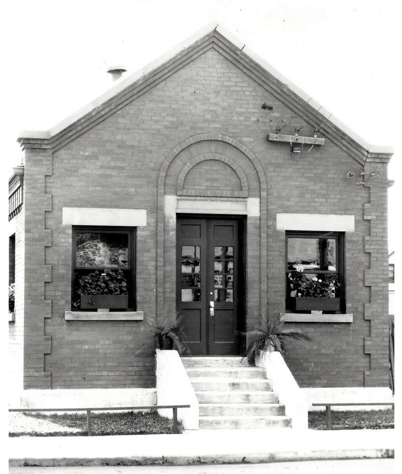
East Calgary Telephone Exchange