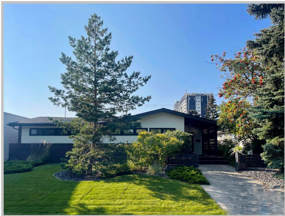
6503 ELBOW DRIVE, SW

PROPOSED LAND USE CHANGE OUTREACH SUMMARY