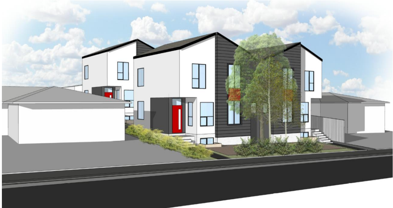
Figure 1: Rendering of the proposed development viewed from 12 Avenue SW

The following excerpts (Figures 1 - 3) from the development permit submission current as of 2022 November 7 provide an overview of the proposal and are included for information purposes only. The development permit plans are subject to change through the development review. Administration's review of the development permit will determine the ultimate building design and site layout details such as parking, landscaping and site access.