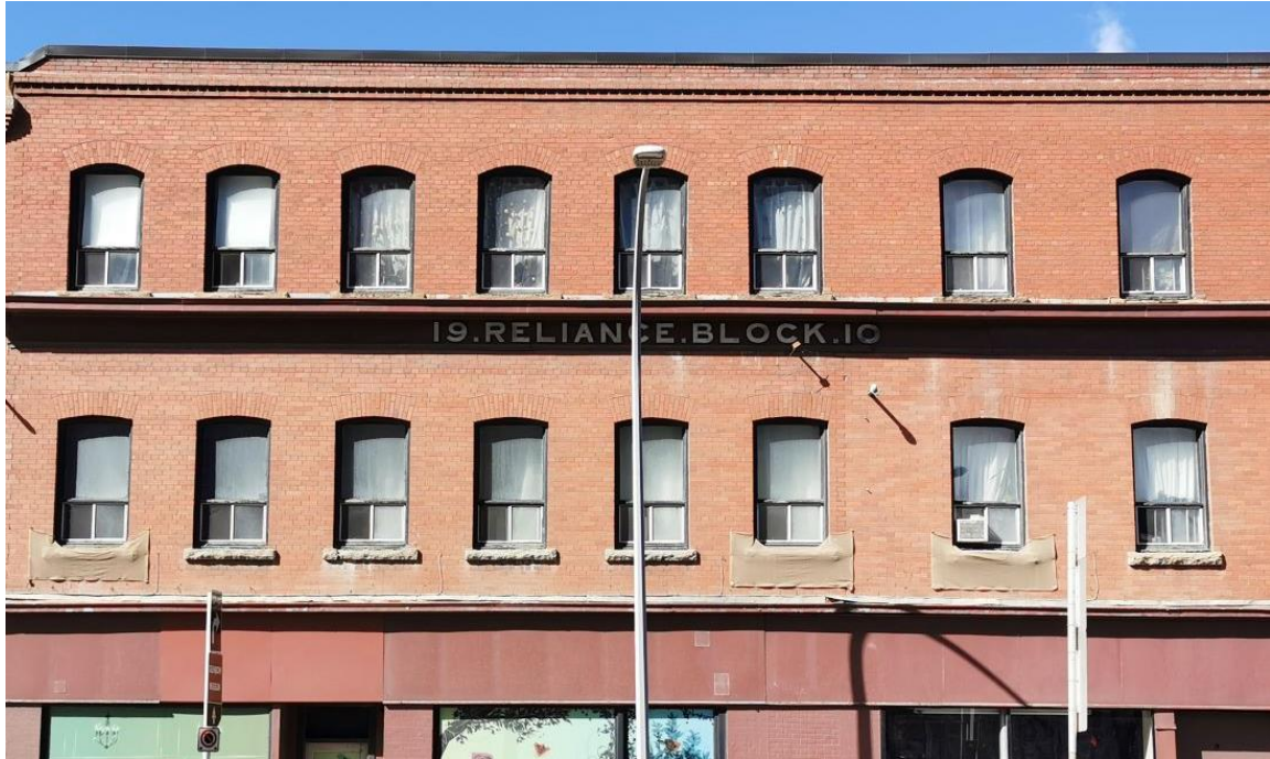
(Image 1.4: Detail of fenestration on 1909-11 building portion; segmental-arched window openings; jack arch brick headers; sandstone window sills)