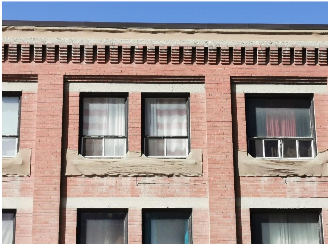
(Image 1.5: Detail of fenestration on the 1912 building portion; heavily corbelled cornice; framed bays and paired, flat-headed window openings)