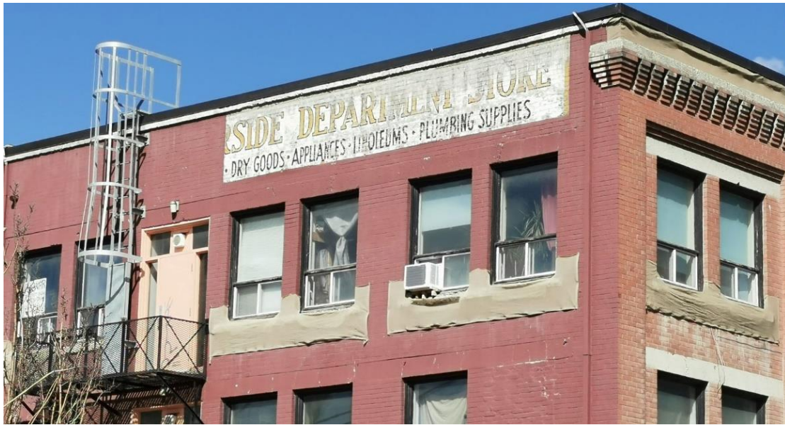
(Image 1.6: Detail of painted 'Riverside Department Store' signage on north façade)