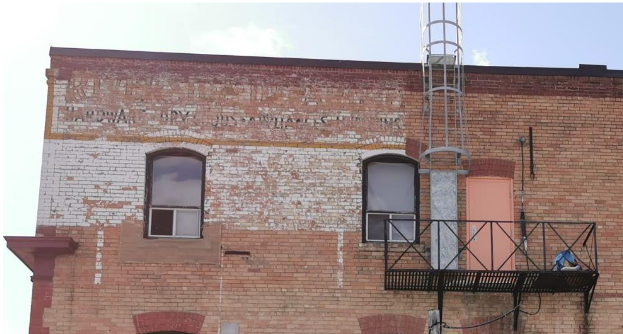
(Image 1.7: Detail of painted "Riverside Department Store" signage on south façade)