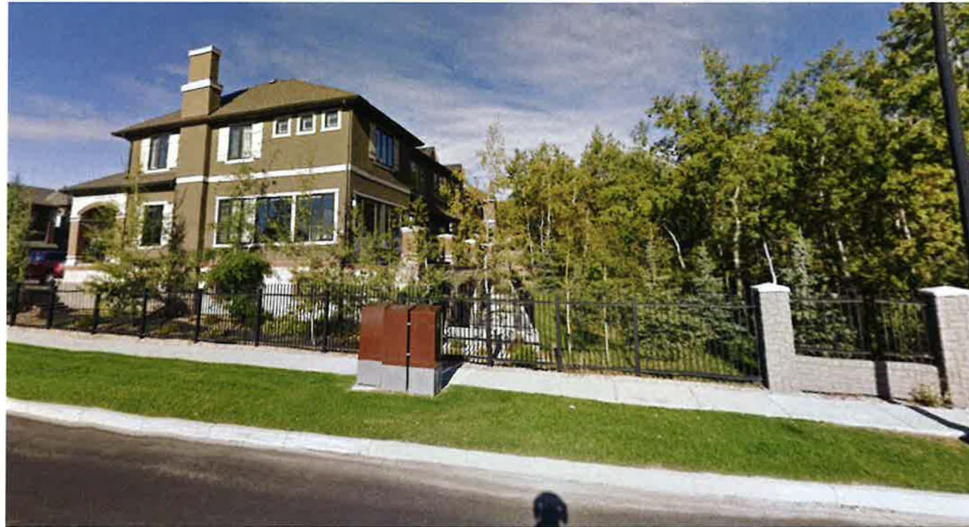
Dagenais home – Restrictive covenant area (7.5m wide with trees) to the right