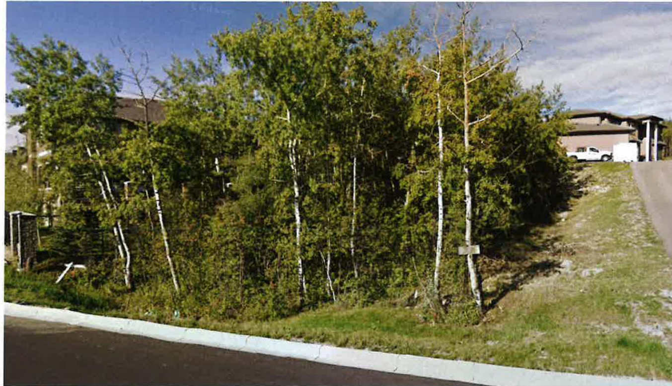
Note the slope/grade on the subject lands