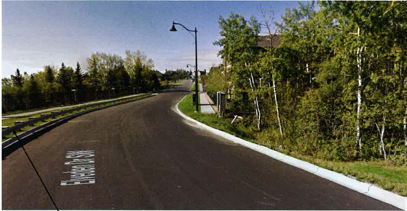
Small Berm along east side of Elveden Drive between guard rail and sidewalk