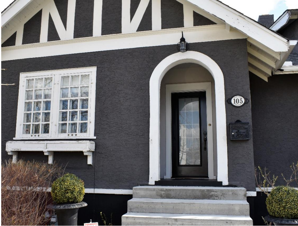
(Image 2.8: Detail of front entry recessed behind wood rounded arch offset under north gable)