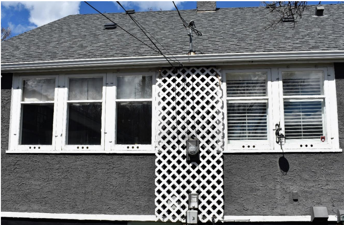
(Image 2.12: Triple and twinned one-over-one, single-hung window assemblies)