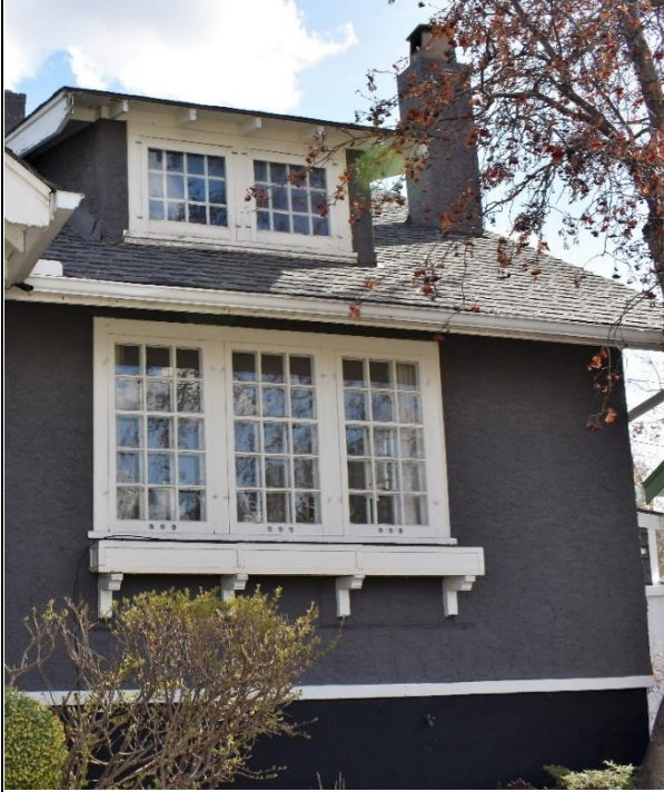
Image 2.10: Typical twinned and triple multi-pane single-hung window assemblies