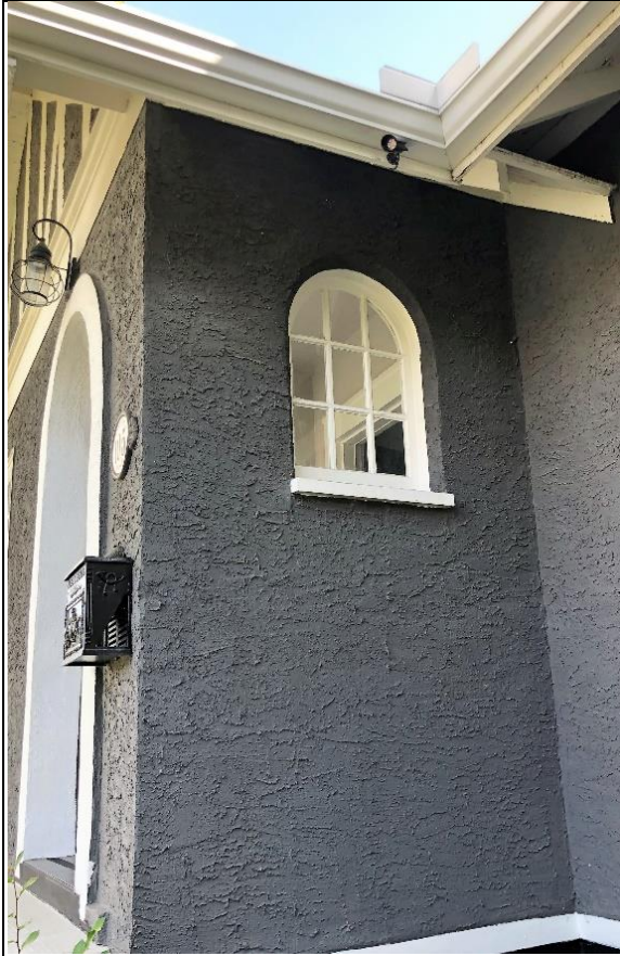
Image 2.13: Fixed semi-circular multi-paned window on west side of covered arched front entry.