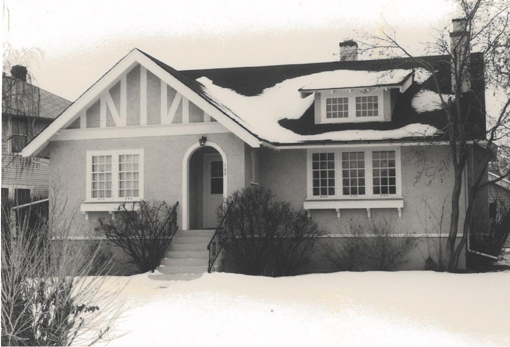
(Image 2.2: North façade ca. 1984, Alberta Heritage Survey Program HS 70869)