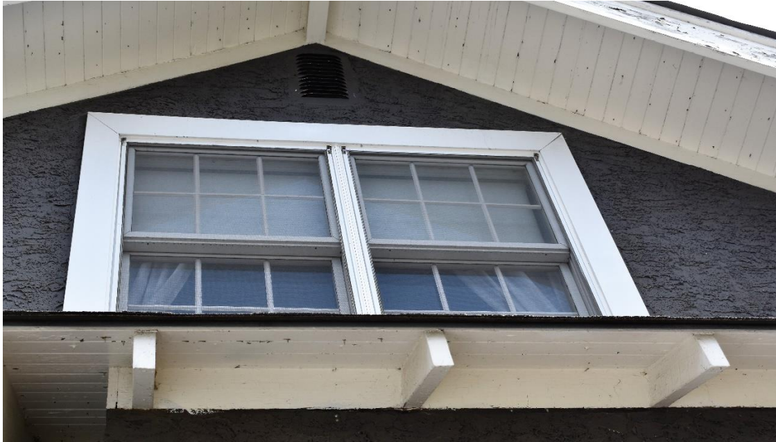
(Image 2.6: Detail of wood tongue-and-groove soffits and exposed rafter tails)