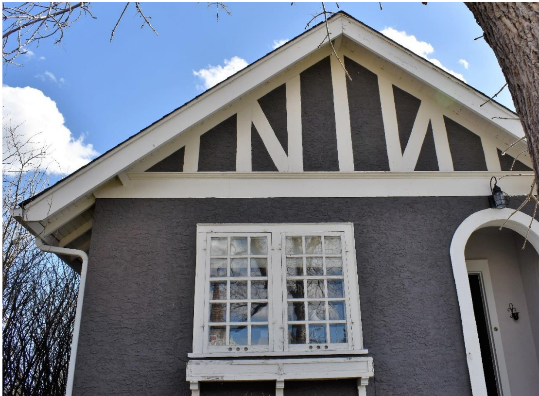
(Image 2.7: Detail of moulded wood verge and mock half-timbering on north gable)