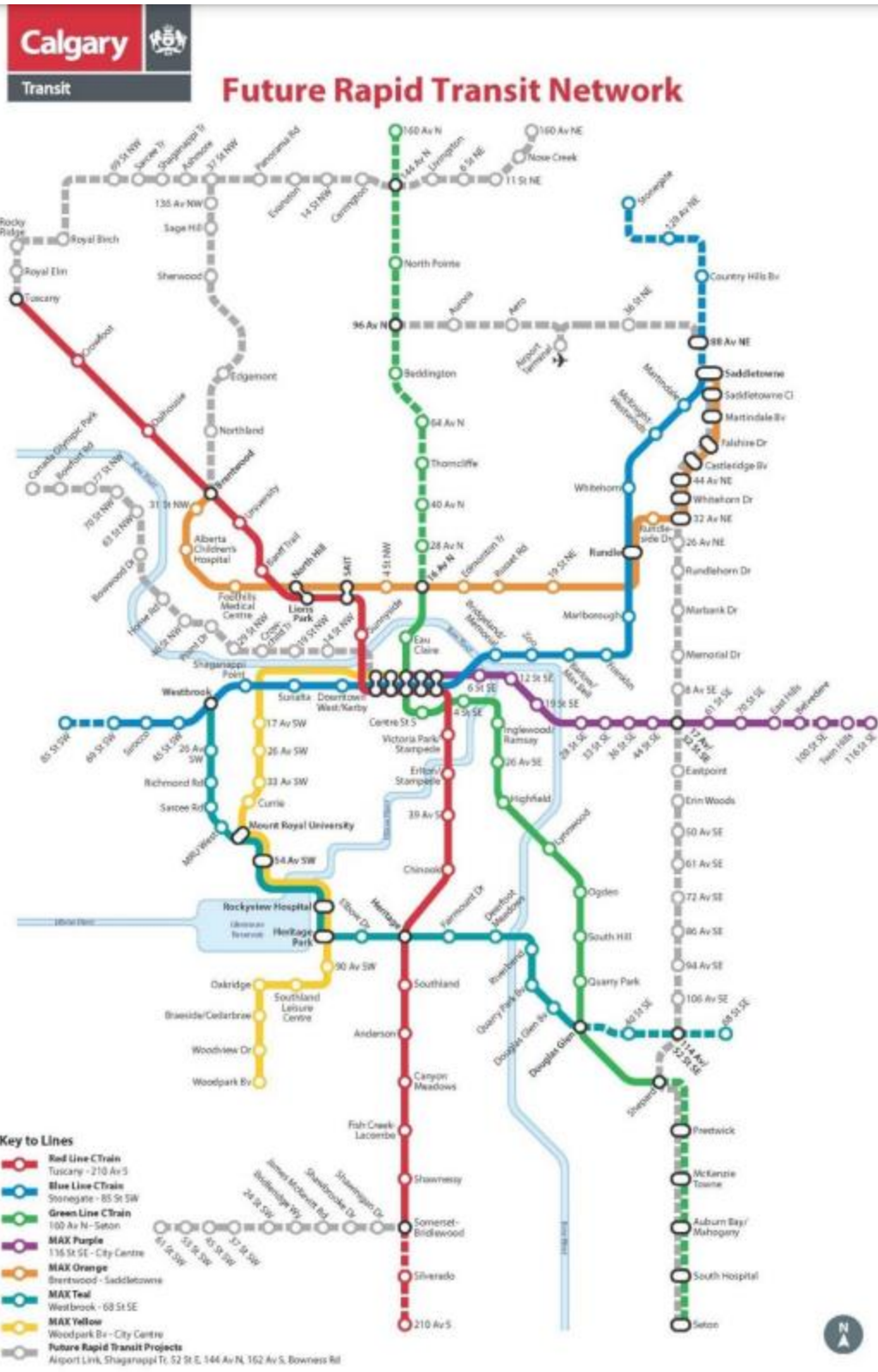
Figure 1. Future Rapid Transit Network