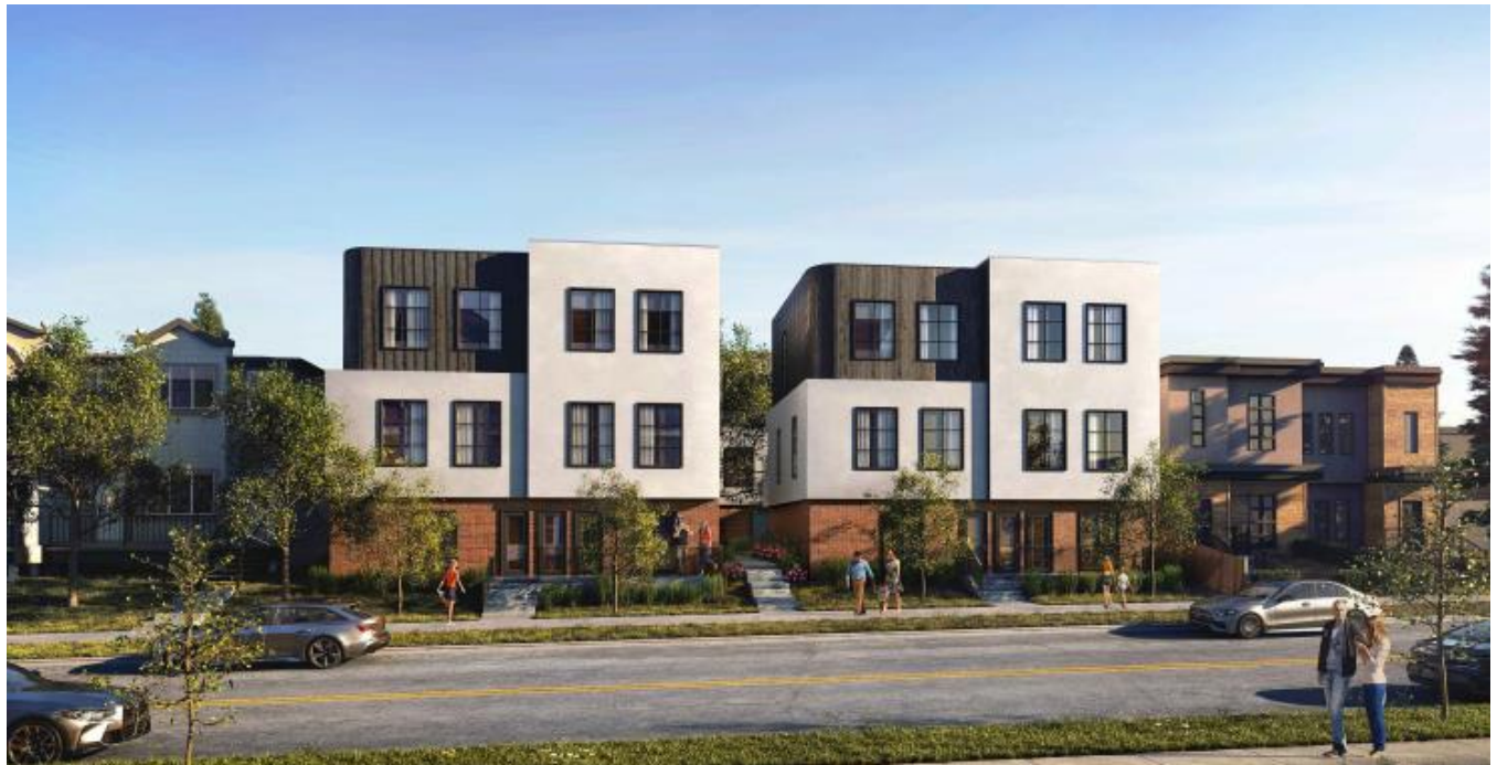
Figure 1: Rendering along 33 Avenue SW

The following excerpts (Figures 1 through 4) from the development permit submission provide an overview of the proposal and are included for information purposes only. The development permit plans are subject to change through the development review process. Administration's review of the development permit will determine the ultimate building design and site layout details such as parking, landscaping, and site access.