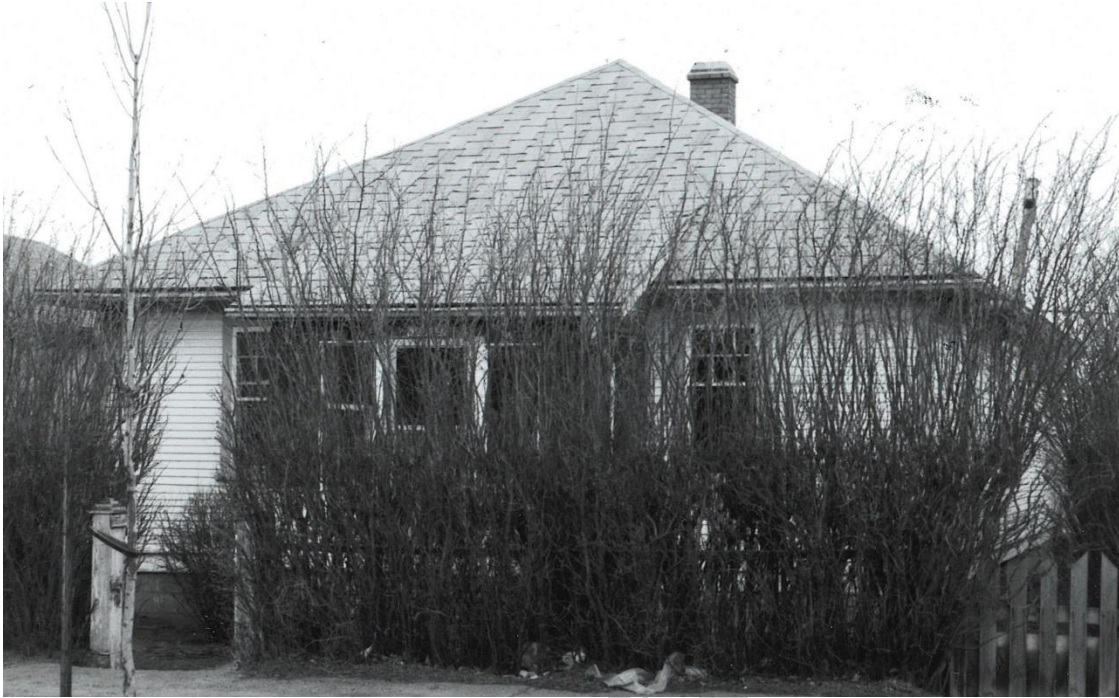
(Image 2.2: West façade, archive image ca. 1984, HS 68461-84-R0130-14)