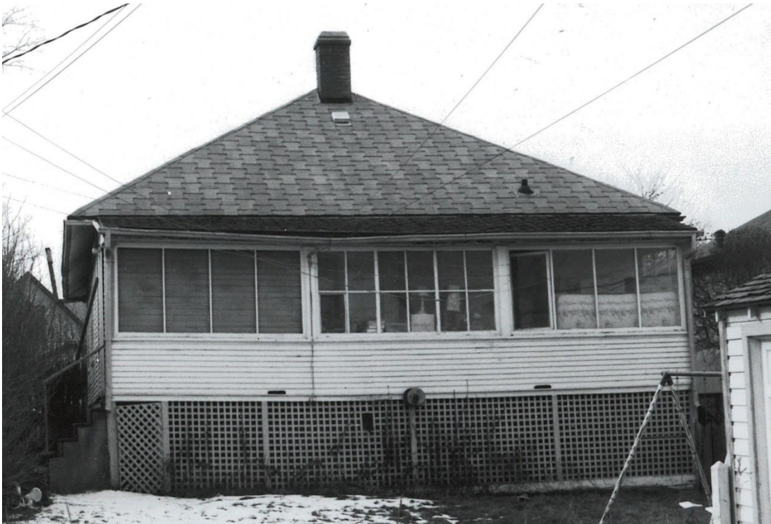
(Image 2.4: East façade with low-pitched shed roof over rear porch, archive image ca. 1984, HS 68461-84-R0130-15)