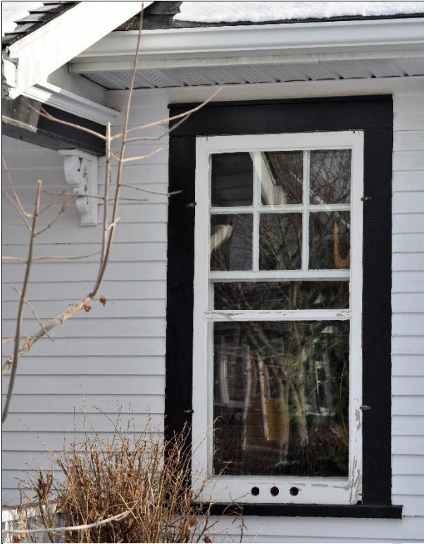
2.10: Detail of typical fenestration, wood side frame and narrow plain lug wood sill