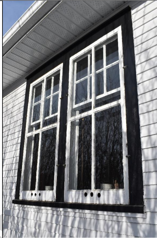
2.11: Detail of typical fenestration, paired assembly, wood frames and narrow plain lug wood sill.