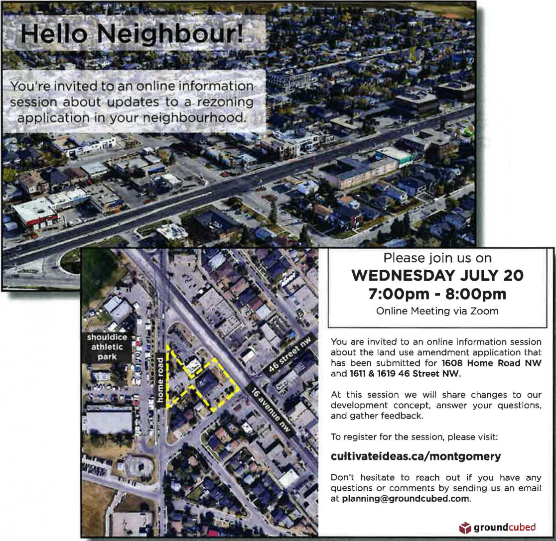
postcard advertisement example