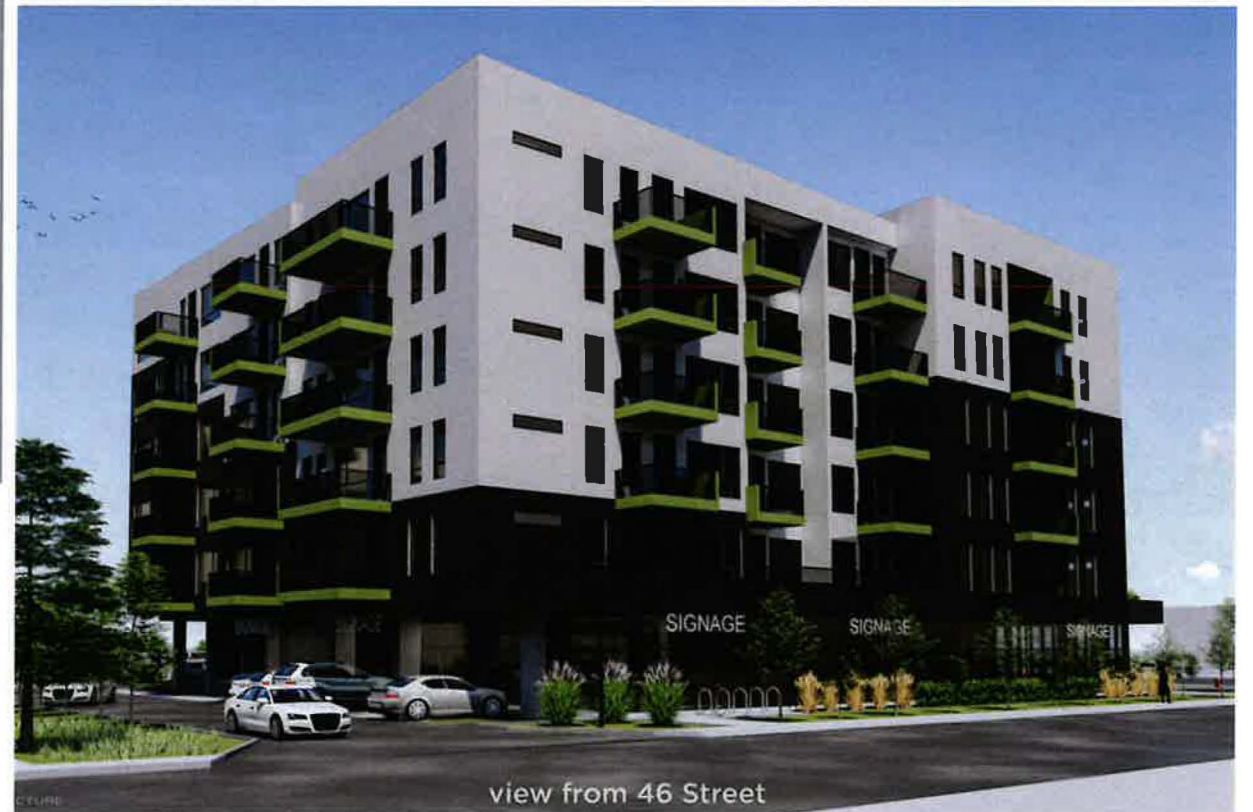
view from 46 Street