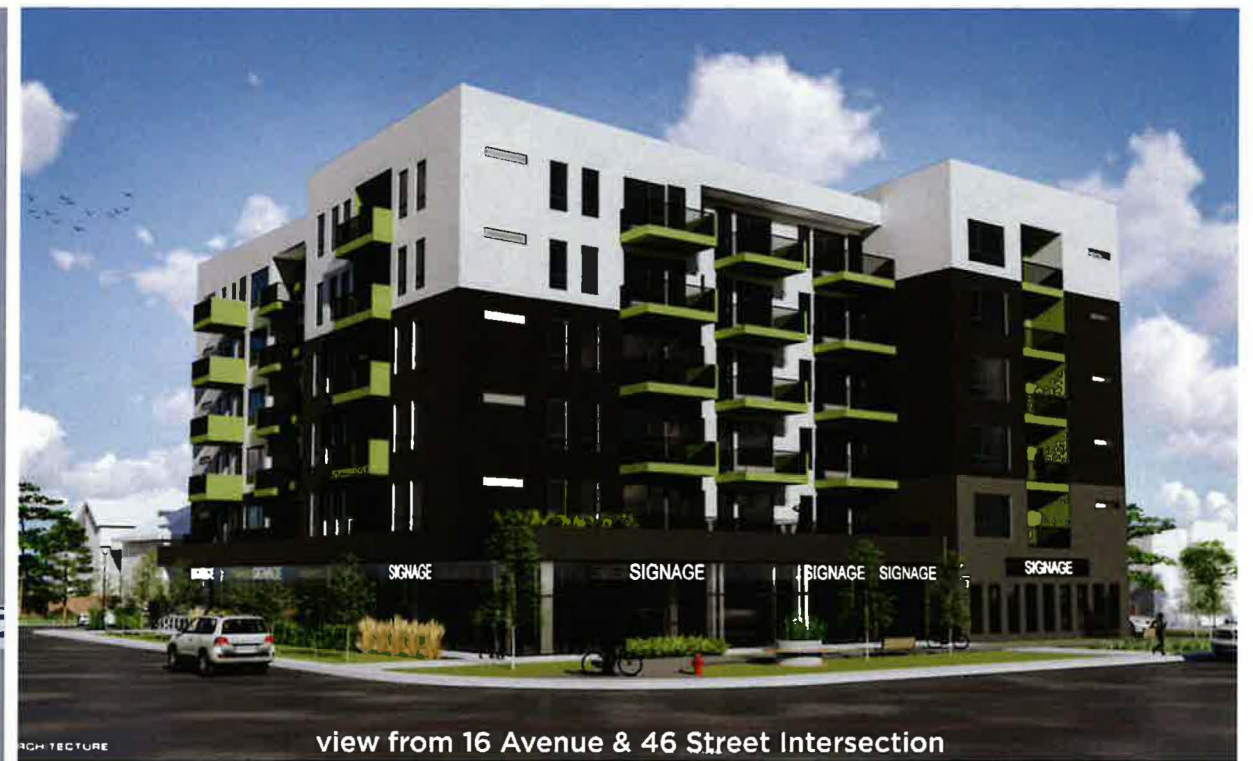
view from 16 Avenue & 46 Street Intersection