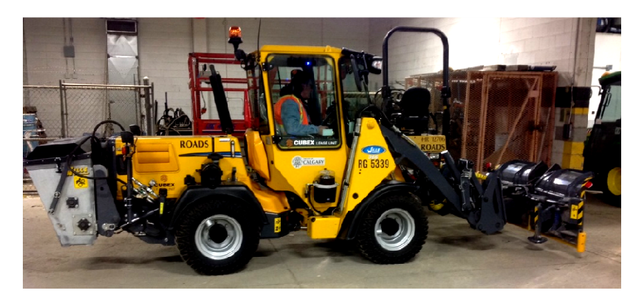
Photo 6 shows specialized snow equipment used by City crews. The Wille was acquired in late 2014 and has different attachments that can be applied depending on snow conditions. Generally, the brush can be used for snow accumulations under 15 centimetres. For greater accumulations, the bucket is used.

For greater accumulations, hand work is also typically required to remove snow that builds up in corners. To-date, City crews have not had to conduct any hand work on the 7 Street SW cycle tracks.