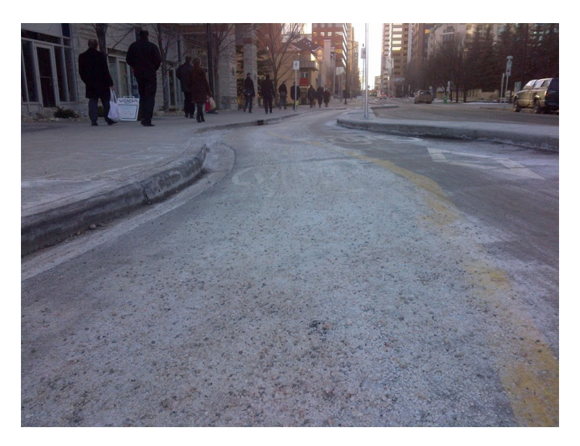
Photo 4 was taken during 2013 and depicts the overuse of SNIC materials. This practice represents a quality concern and operational issue.