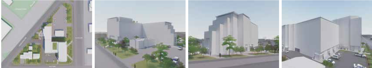
Figure 2. Conceptual renderings of the original design concept.

Engagement activities in the first phase of the project occurred in 2021 and revolved around the original concept design for the site. This original concept featured closing the existing lane to join the subject parcels together with a single mixed-use development, and a proposed building height of 30m (8 storeys).