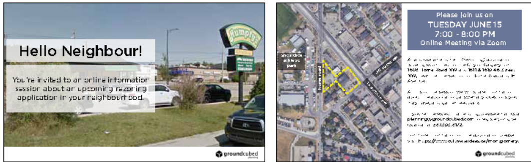
Figure 3. Postcard used to advertise online information session. Front (left) and back (right).

The session was advertised via direct mail postcard to 463 addresses (residential and businesses) surrounding the site. A PDF of the postcard was also sent to the CA and BIA for distribution.