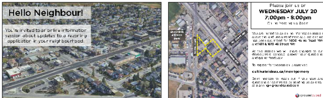
Figure 6. Postcard used to advertise the second online information session. Front (left) and back (right).

The second online session was advertised via direct mail postcard to 463 addresses surrounding the site, similar to the first session. The CA, BIA, and Ward 7 Councillor's office were also invited via email. A link to register for the event was posted on the project website as well.