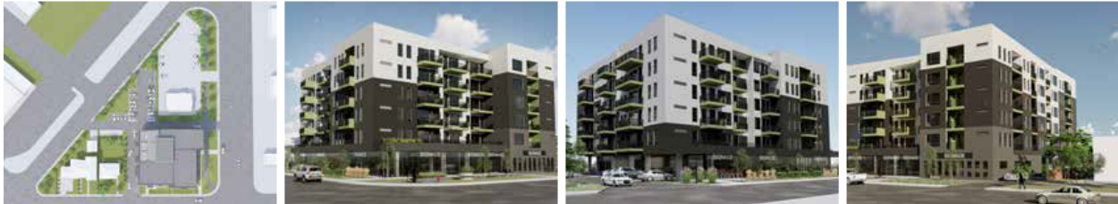
Figure 5. Conceptual renderings of the revised design concept.

The second phase of stakeholder outreach activities took place in 2022 and involved presenting the revisions to the development concept based on what we heard in Phase One.