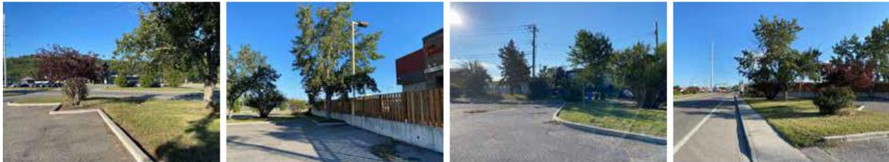
Figure 4. Images of parking lot after clean up.