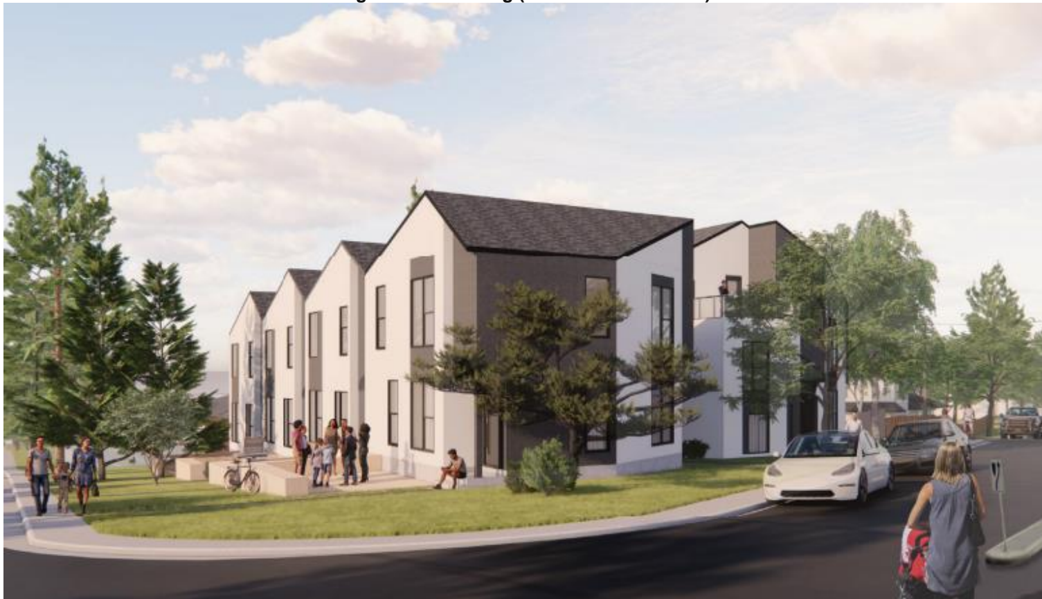
Figure 1: Rendering (Southwest Elevation)

The following excerpts from the development permit submission provide an overview of the proposal and are included for information purposes only. The development permit plans are subject to change through the development review. Administration's review of the development permit will determine the ultimate building design and site layout details such as parking, landscaping, and site access will be determined through the Development Permit review.