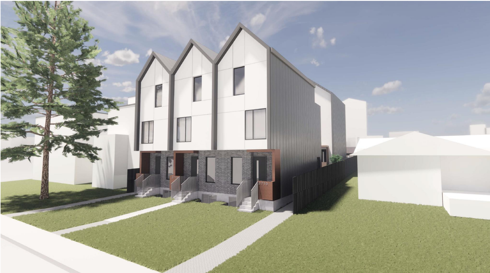
Figure 1: Render (looking southwest)