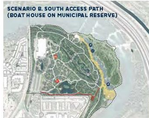
SCENARIO B. SOUTH ACCESS PATH (BOAT HOUSE ON MUNICIPAL RESERVE)