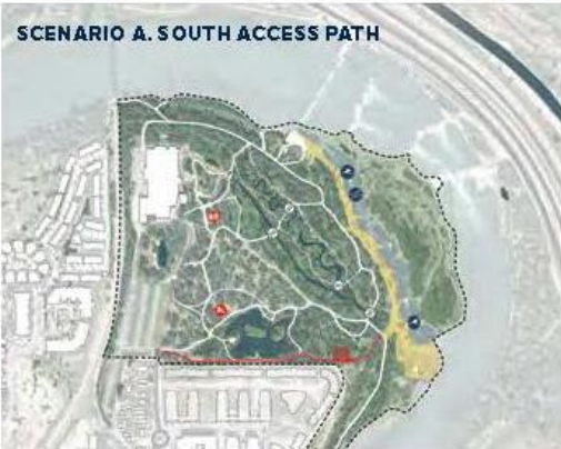
SCENARIO A. SOUTH ACCESS PATH

The discussion covered a wide range of viewpoints on the four suggested locations for the Boat House, and did not result in definitive direction. There were a mix of opinions if there should even be a Boat House. Support for the Boat House stems from leveraging the use of Harvie Passage for better river use education, aquatic safety, and promotion of economic opportunities. At the same time, others feel it is unfair to build an amenity for a limited user group, while taking away more natural green space.