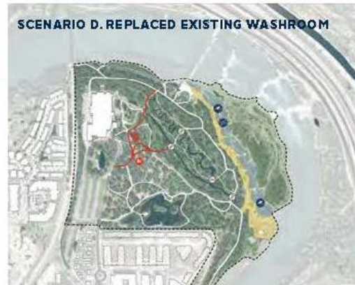
SCENARIO D. REPLACED EXISTING WASHROOM