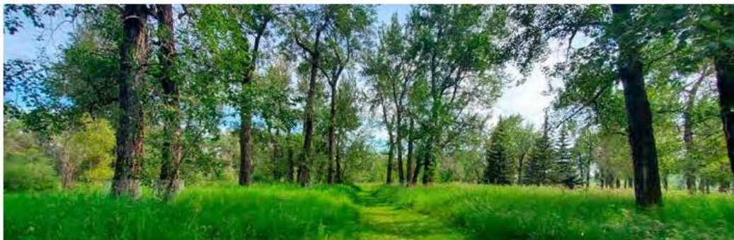
HARVIE PASSAGE FEP | WORKSHOP SUMMARY