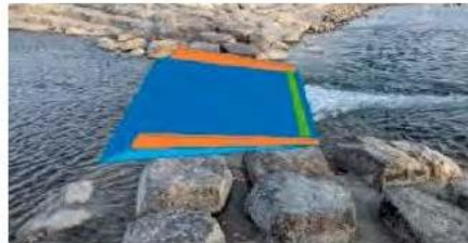
Image from Overview of Harvie Passage low water channel adjustable wave concept, Alberta River Surfing Association and Alberta Whitewater Association, March 7 2022

Do you see the wave modification at Harvie Passage being of benefit? If not, what are some concerns around the proposed wave modification?