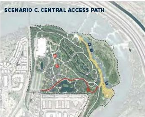
SCENARIO C. CENTRAL ACCESS PATH