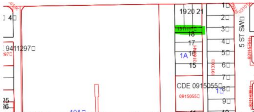
Exhibit I. Public laneway, highlighted in green, will be sold from City of Calgary to the Applicant in the event an LOC Application is approved.