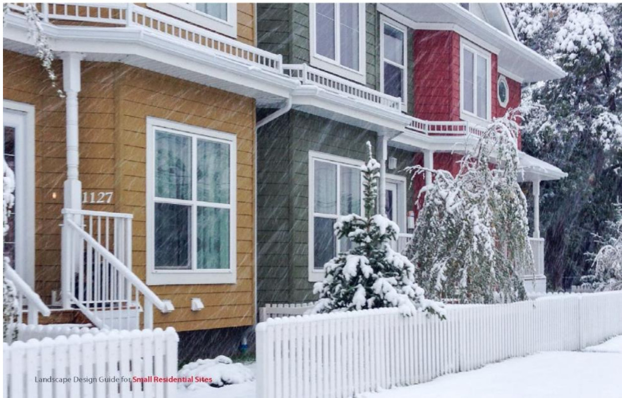
Landscape Design Guide for Small Residential Sites

A comprehensive design process for small residential sites creates urban landscapes that promote well-being and contribute to healthy urban ecosystems. Residents can easily understand what amenity spaces are available to them, enjoy programming that is provided and are able to care for the outdoor spaces around their homes. Residents and visitors alike feel welcomed and safe, while outdoor spaces are animated and enhanced with architectural and landscape elements rich with dynamic plant and wildlife communities.