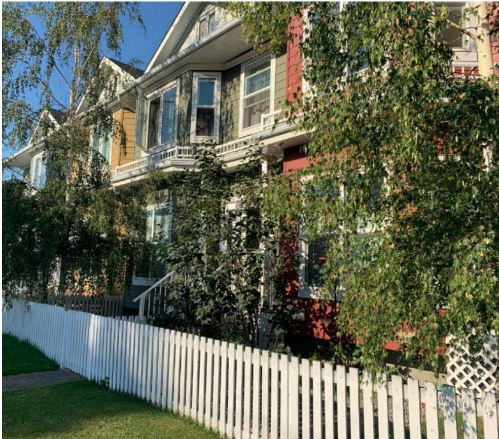
Setback design animates the streetscape and defines semi-private space.

Flexibility in building layout and massing offers the opportunity to design high-quality amenity spaces, setback areas and streetscapes. Locate buildings and upper storey massing to maximize sunlight access for amenity spaces and neighbouring parcels and provide space for layered landscaped areas and complementary setback and streetscape design. Consider the location of adjacent yard space and buildings. Where feasible, align buildings with neighbouring buildings, and amenity spaces and landscaped areas with neighbouring yards.