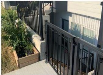
Below-grade amenity spaces are set back from the public sidewalk and screened with planting to provide privacy while maintaining access to daylight and view above.