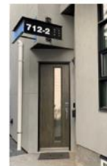
Generous pathways that connect to the public sidewalk, enhanced with planting areas and unique address signs, lead residents and visitors to units accessed from the outdoor amenity space.