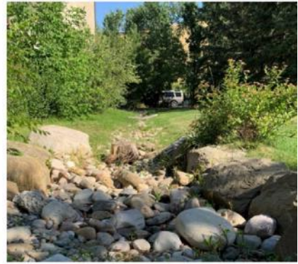
Stormwater management strategies can be a feature in landscape design.