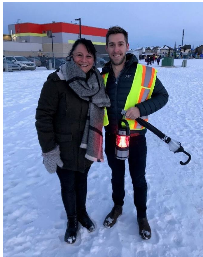
School staff supporting Winter Walk to School Day at Manmeet Singh Bhullar School