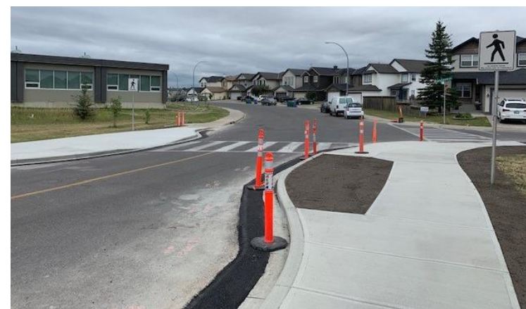
Curb extensions at Manmeet Singh Bhuller