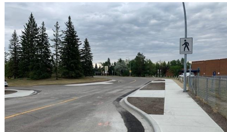
Curb extensions at Sam Livingston