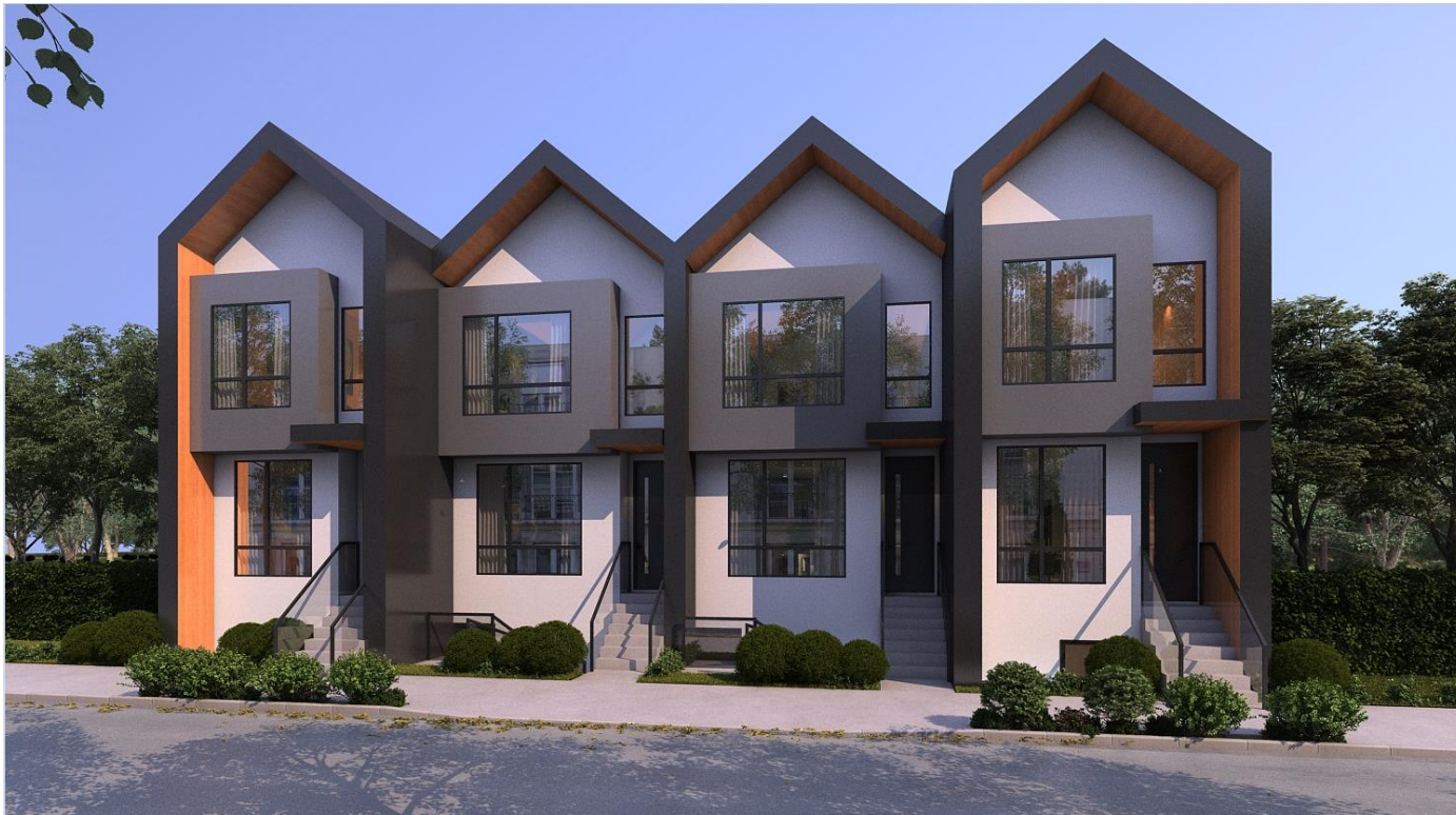
Figure 1: Rendering of Proposed Development

The following figures from the development permit submission provide an overview of the proposal and are included for information purposes only and are subject to change through the development review. Administration's review of the development permit will determine the final building design, and site layout details such as parking, landscaping and site access.