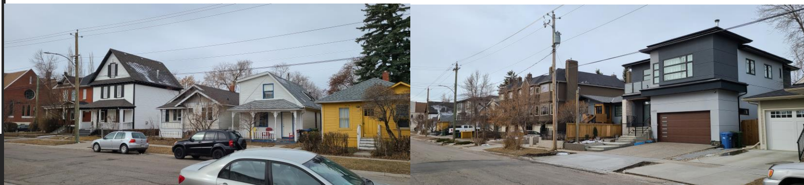
View of East Side of 1 st from 15 th Ave to 13 th Ave NW As noted in the photos below of 1 st East Side there is Multi Unit affordable housing and in the right photo below is a sample of the calming measures the neighborhood have had in place for 20 years.