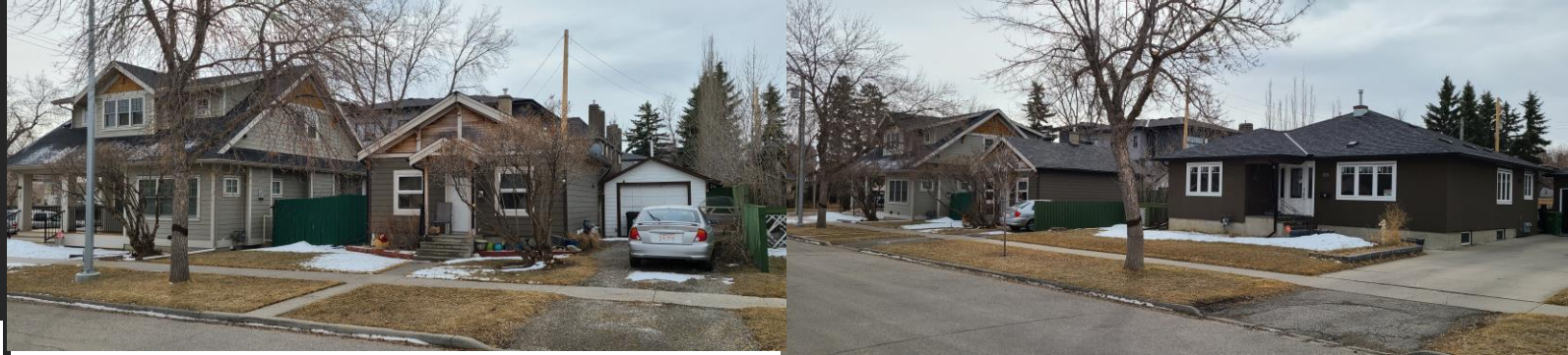
View of West Side of 1 st from 15 th Ave to 13 th Ave NW As noted in the photos below of 1 st West Side there is Heritage homes, row townhouses, new builds, good stock affordable housing and attached homes providing a good social economical mix for our neighborhood..