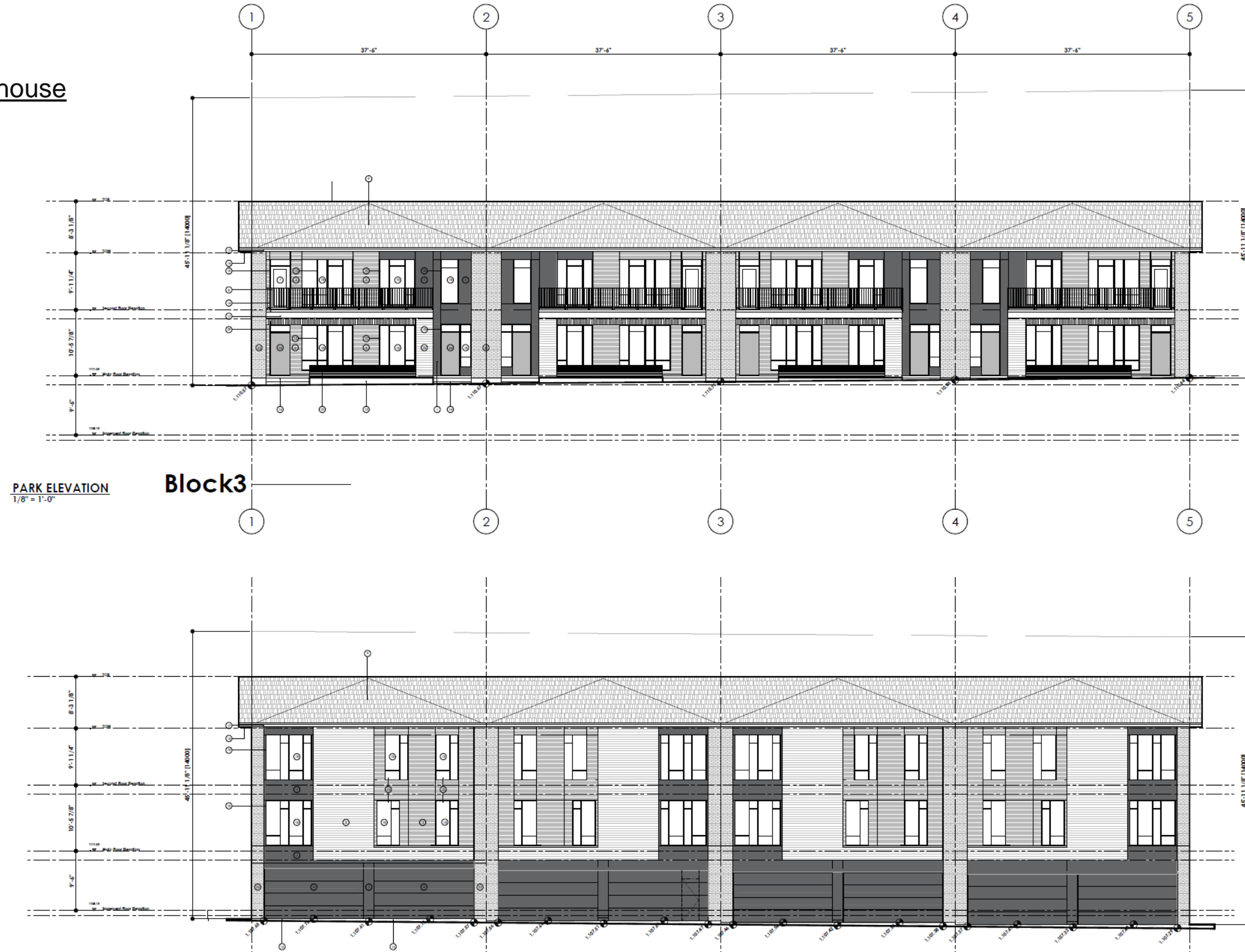
Fig 2: Townhouse