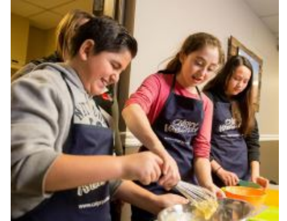
In Sunalta, inclusivity is the heart of community

Read the full edition for more stories, videos, and information