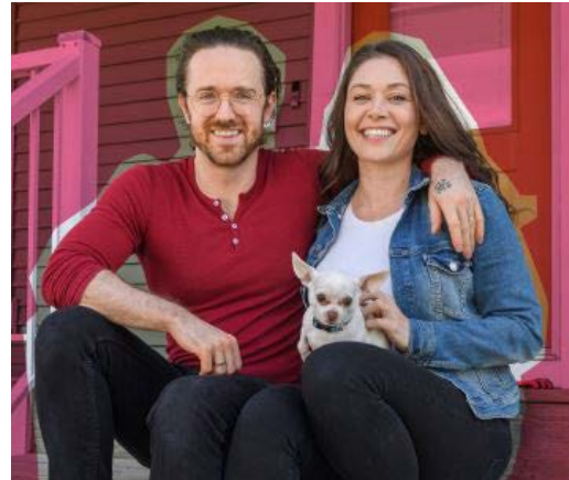
Making Calgary home sweet home