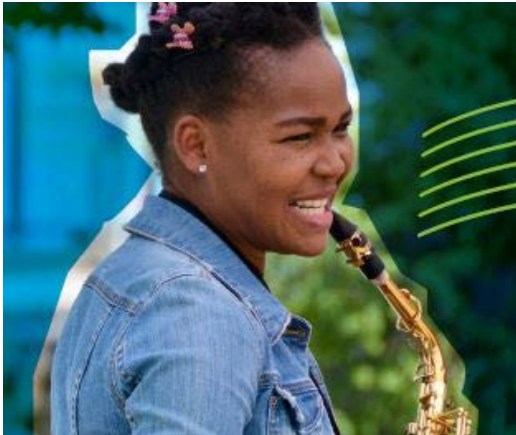
Road to recovery: Resilience of Calgary's creative communities