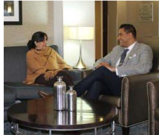
Survive, revive, and thrive: Calgary's hotel sector weathers the storm with help from The City