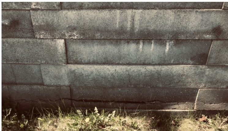
Glenmore Tr SW