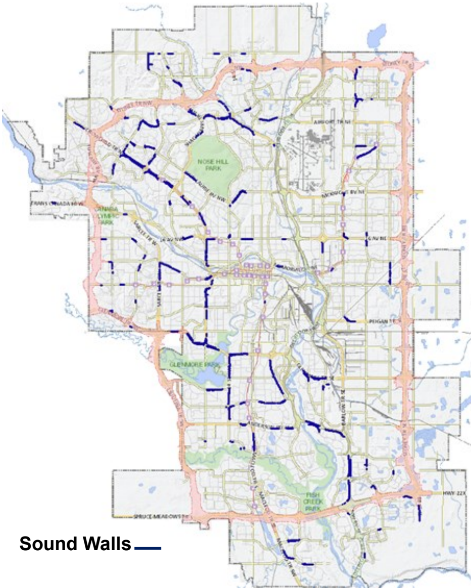
Sound Walls —