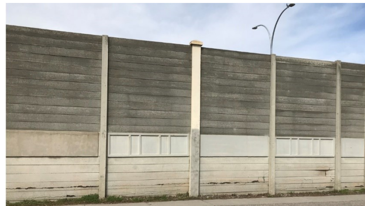
14 St SW