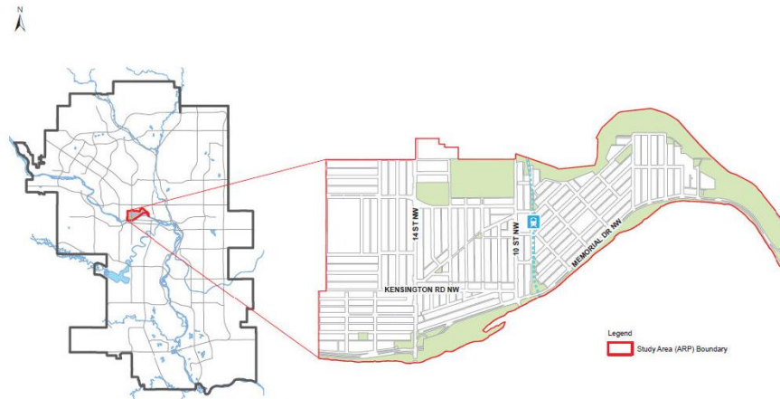
Figure 2: Area of Implementation

The regulations for expenditure of HSCAF funds to implement projects apply within the Hillhurst/Sunnyside Community as defined in the Hillhurst/Sunnyside ARP (see Figure 2).