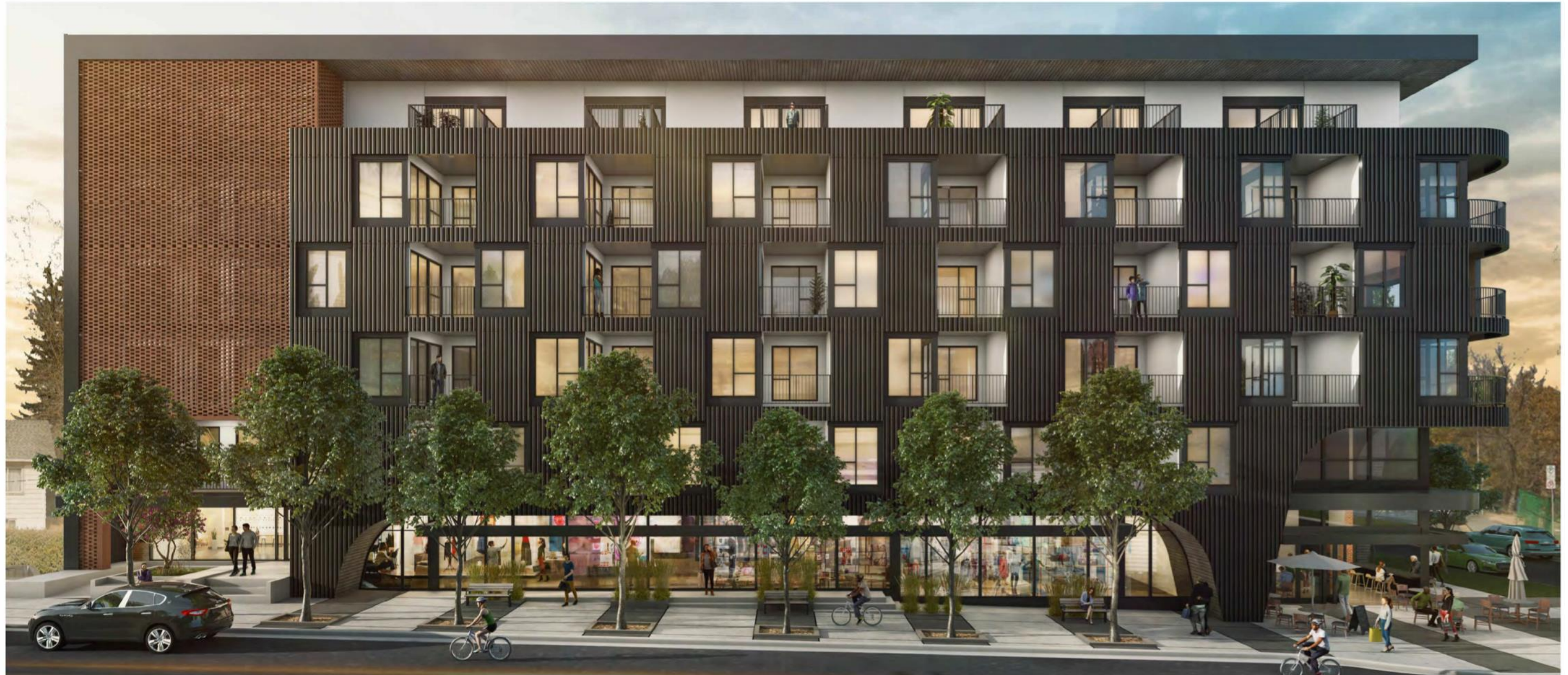
Figure 1 - Rendering

This Development Permit was submitted by S2 Architecture on 2021 April 13. It proposes a mixed-use building 22 metres in height with 82 Dwelling Units, 8 Live Work Units, and ~375 square metres of commercial floor space.