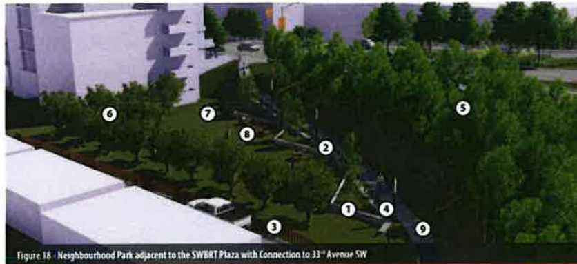
Figure 18 - Neighbourhood Park adjacent to the SWBRT Plaza with Connection to 33rd Avenue SW