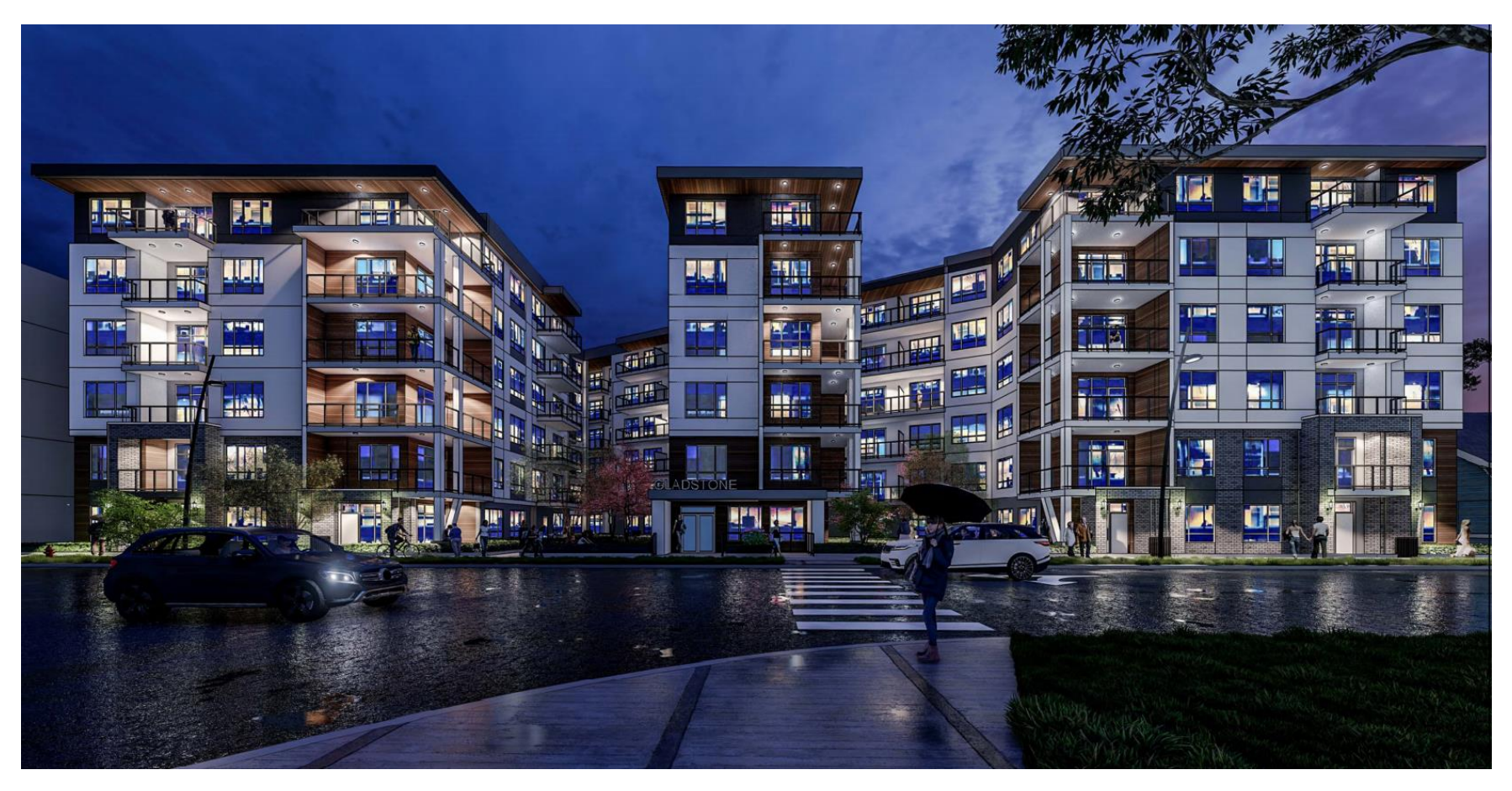
Figure 3: Rendering from Gladstone Road NW