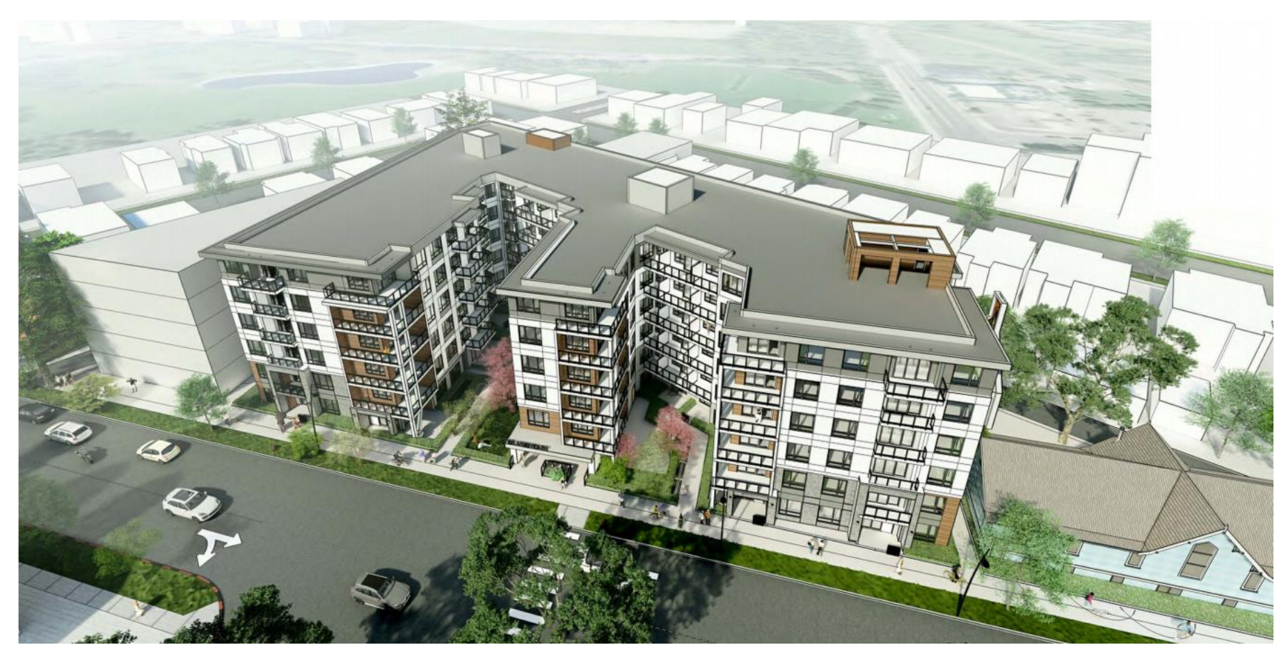
Figure 2: Rendering from Gladstone Road NW