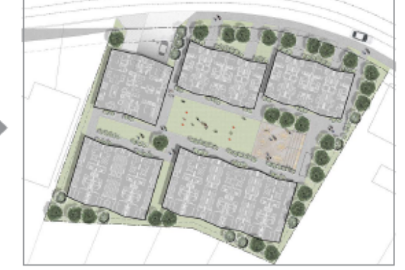
REVISED PROPOSAL DC BASED ON M-CG