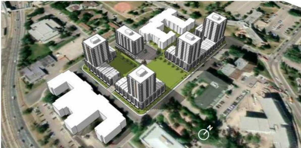
Vision Concept - 3D Render

The concept for the six-acre site includes a mix of uses and varied housing forms centered around a key pathway connection and a central green space. An activity node will exist adjacent to 11 Street NE, with a mix of uses contemplated for this location. Active uses will “spill” onto the east-west pathway (also known as the “East Riverside Greenway”), drawing people from the Bridgeland-Memorial LRT station into the internal park space and to destinations beyond.