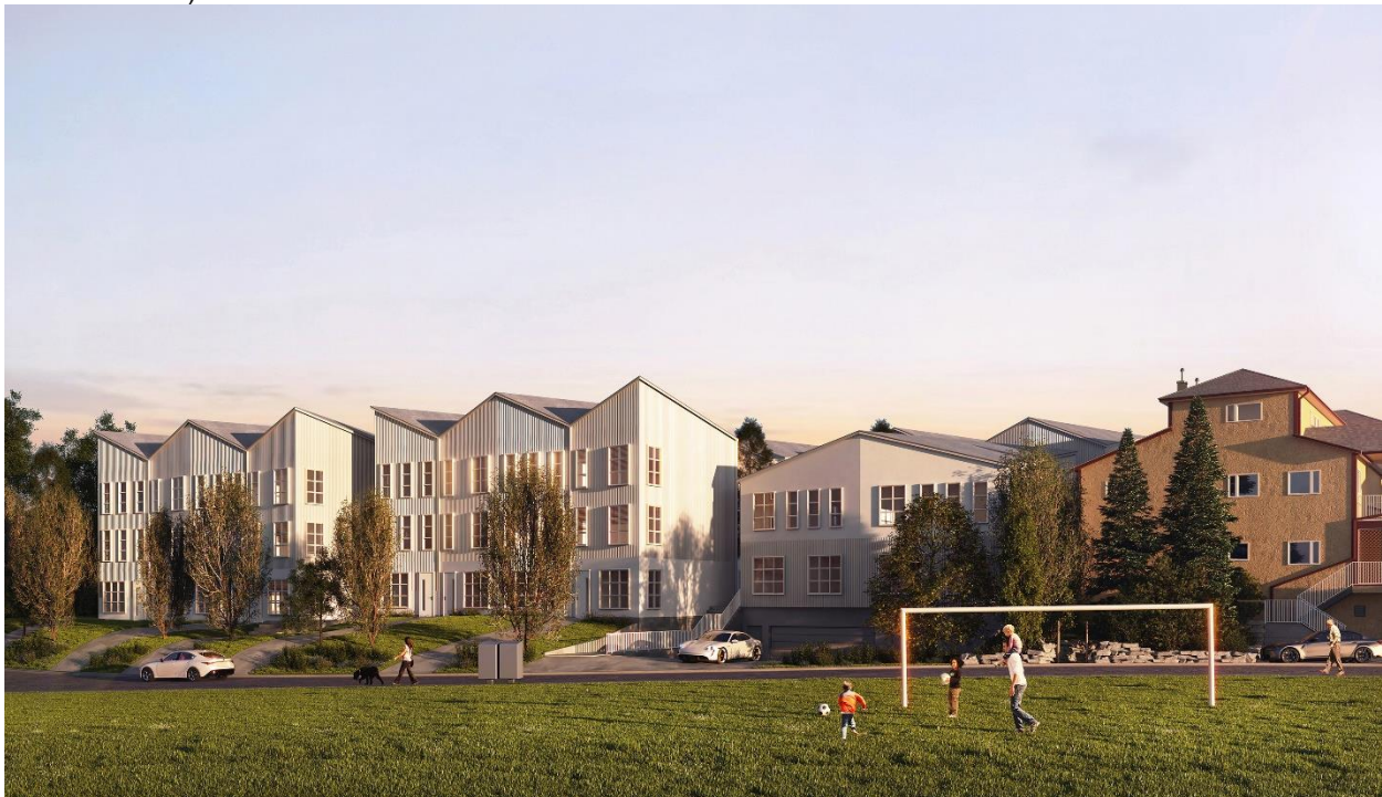
Figure 1: Rendering of Proposed Development (perspective view looking southeast, from George P. Vanier School)

The following renderings (Figures 1, 2, 3 and 4) from the development permit application provide an overview of the proposal and are included for information purposes only. Administration's review of the development permit application will determine the ultimate site and building layout, building design, parking, landscaping and site access. No decision will be made on the development permit application until Council has made a decision on this land use amendment application.