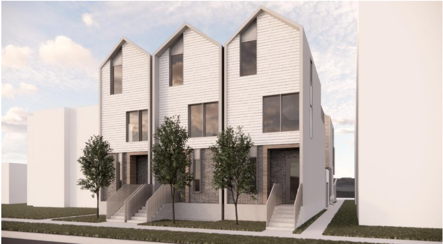
Figure 1: Rendering (North Elevation)