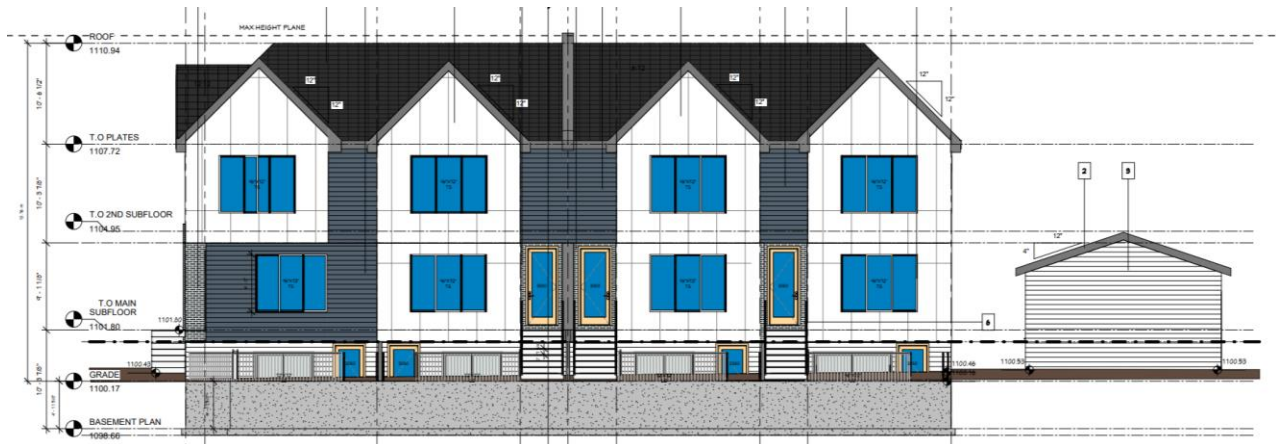
Figure 2 Front Elevation