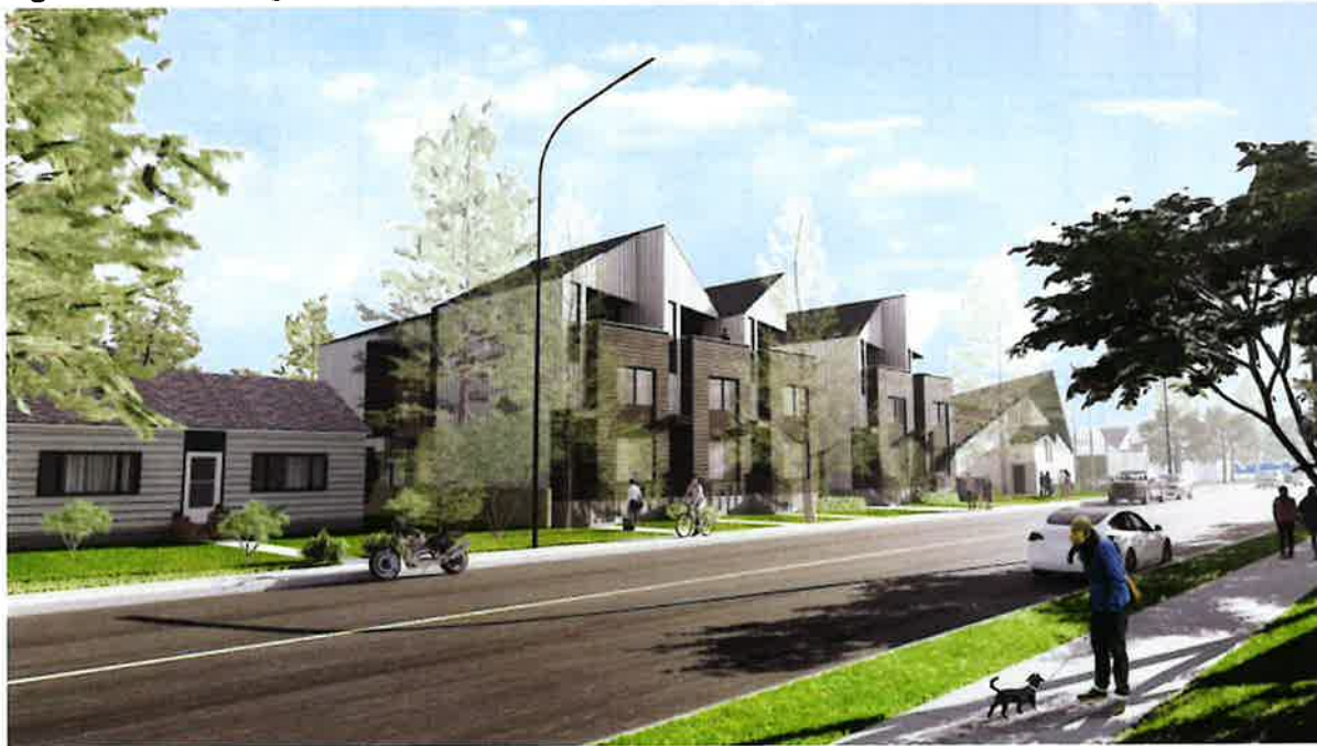
Figure 1: Rendering of Proposed Development

Administration's review of the development permit will determine the ultimate building design, and site layout details such as parking, landscaping and site access. No decision will be made on the development permit application until Council has made a decision on this land use redesignation.