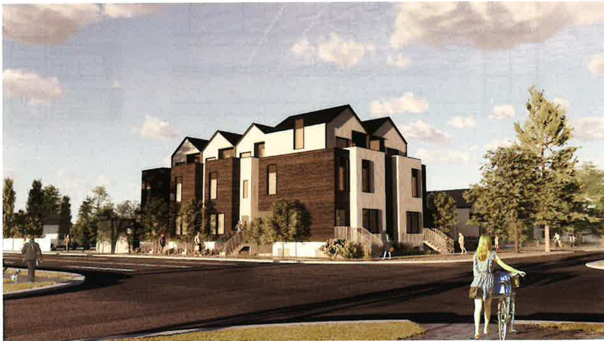
Figure 1: Rendering of Proposed Development

Administration's review of the development permit will determine the ultimate building design, and site layout details such as parking, landscaping and site access. No decision will be made on the development permit application until Council has made a decision on this land use redesignation.