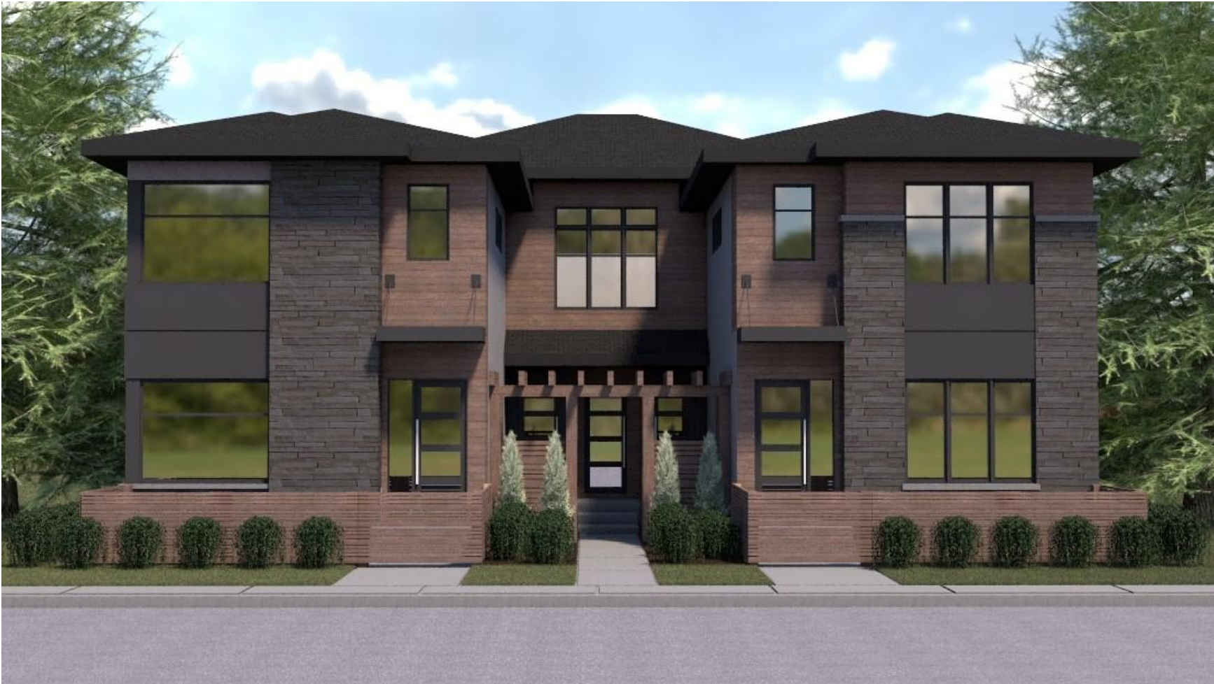
Figure 1: Rendering

A Development Permit (DP2021-0979) was submitted by Lighthouse Studios 2021 February 17. The Development Permit application is for a 5 unit residential development with detached garage.