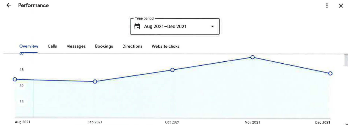
Figure1: Google map Overview From Aug 2021- Dec 2021 How many people inquiry in each month

The main reason for requesting a zoning re-evaluation is I have a high demand of parents asking for more daycare spaces but I need a new zoning. Many frustrated parents can't get their kids into the school care centers since they are full. In 2019 I have had at least 30 families wanting to be at my daycare but because I can't find a proper property for daycare so i cannot help them. In 2021 summer, when I was planning to operate day home, I got a high demand inquiry from Google Map.