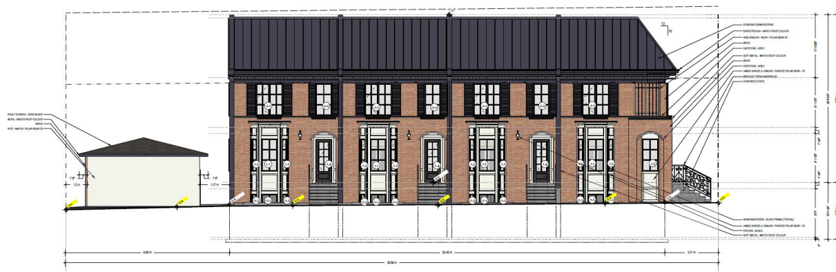
Figure 2: North (front) Elevation