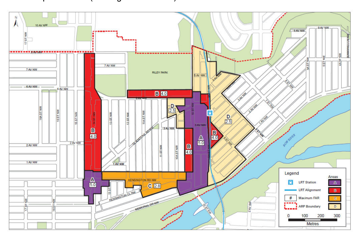
Figure 1: Area of Applicability

The regulations of the HSCAF apply in the area as defined in the Hillhurst/Sunnyside Area Redevelopment Plan (see Figure 1 and 1.1).